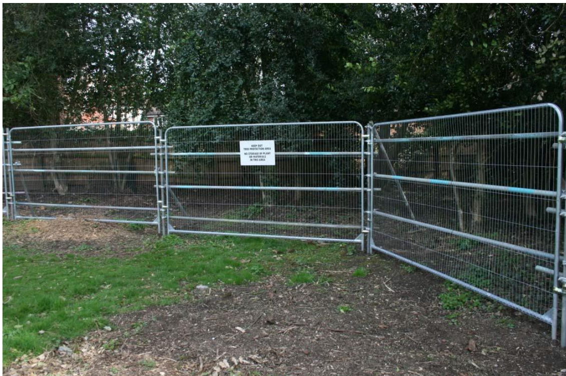
Figure 3: An example of protective fencing erected to the correct specification

An example specification is shown in Figure 3.