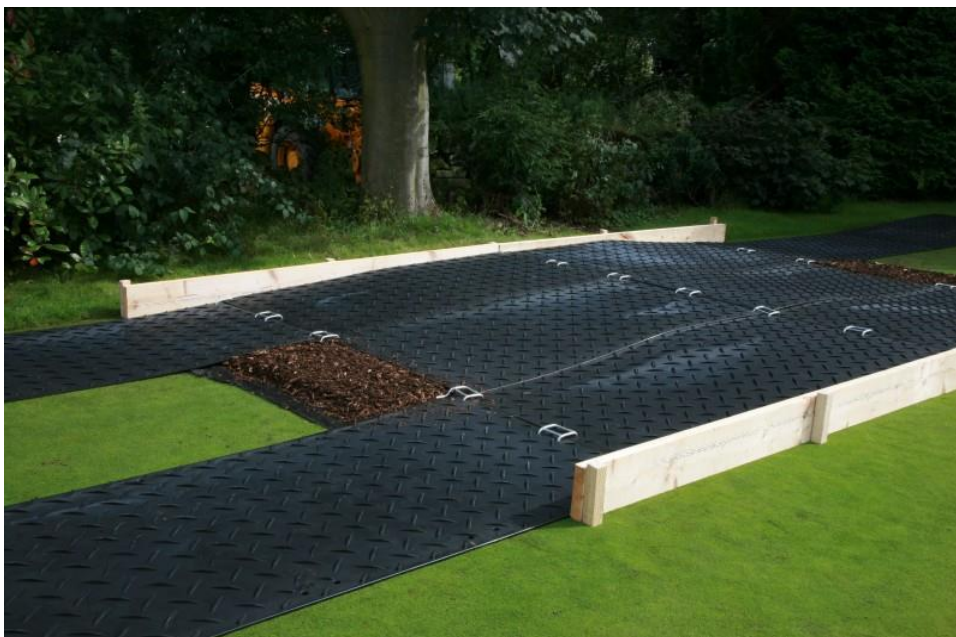
Figure 1: An example of ground protection to protect against vehicular access

The temporary ground protection shall remain 'fit for purpose' throughout the duration of development and so the compressible fill layer may need topping up on occasion. An example of this specification is shown in Figure 1.