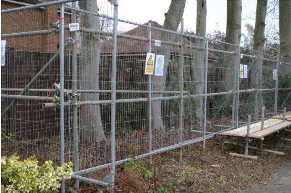
Figure 2: An example of 'floating' ground protection

If temporary ground protection is required close to an excavated area (i.e. basements or deep foundations), then a site-specific scaffold framework shall be constructed to provide a 'floating walkway'. This is to avoid the protected area subsiding into the excavated area (see Figure 2 for an example).