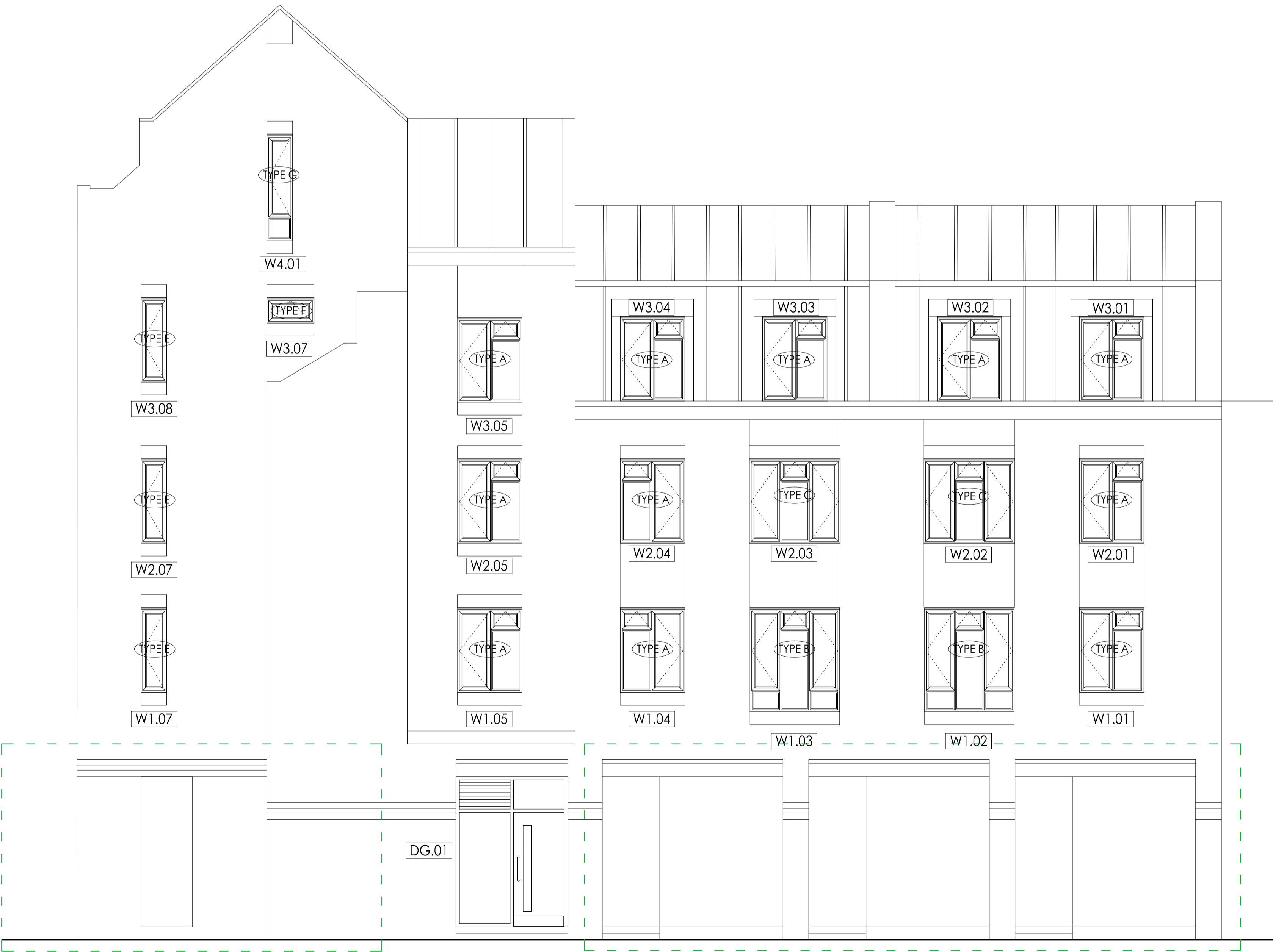
PROPOSED ELEVATION A SCALE 1:50 @ A1