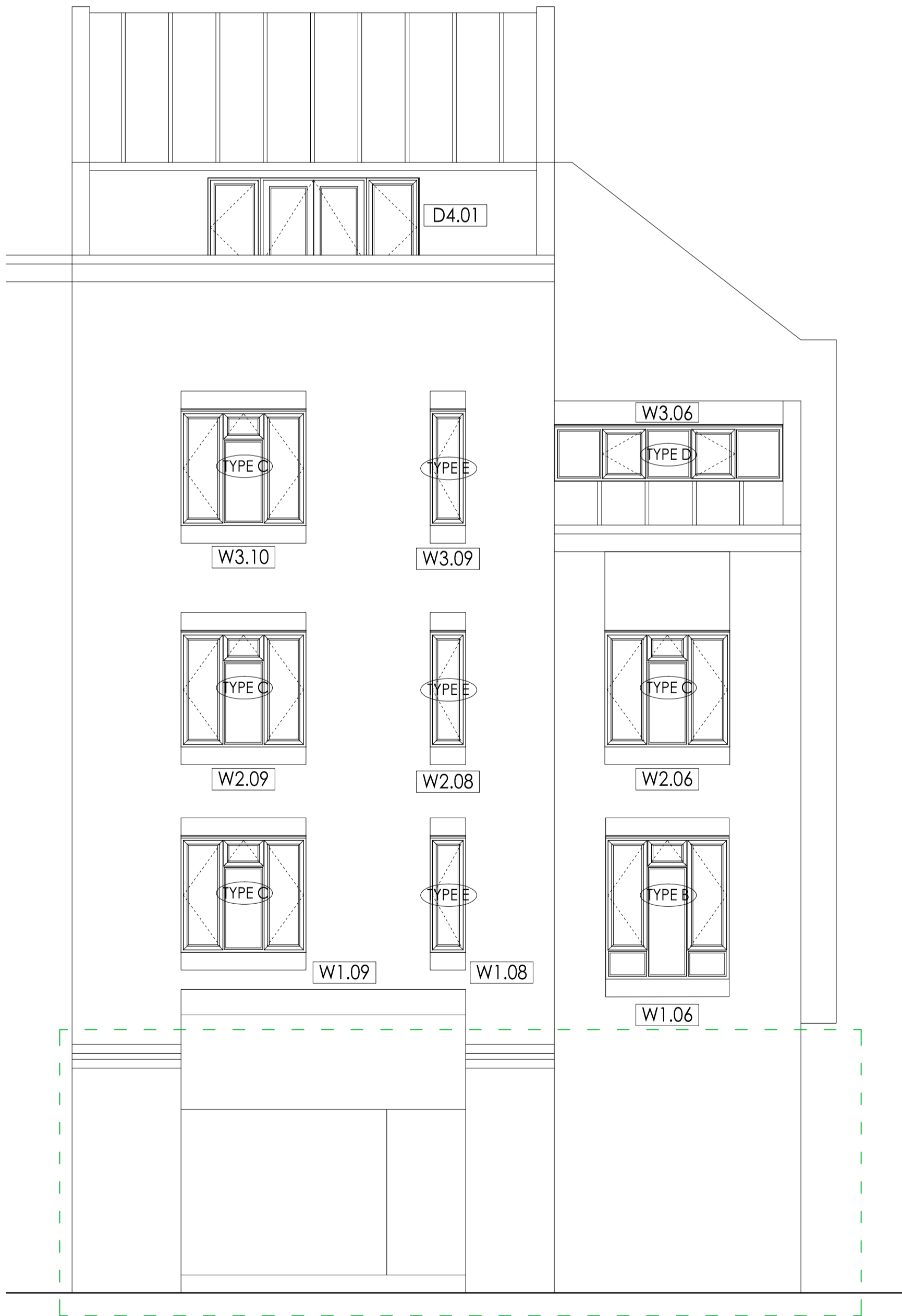
PROPOSED ELEVATION B SCALE 1:50 @ A1