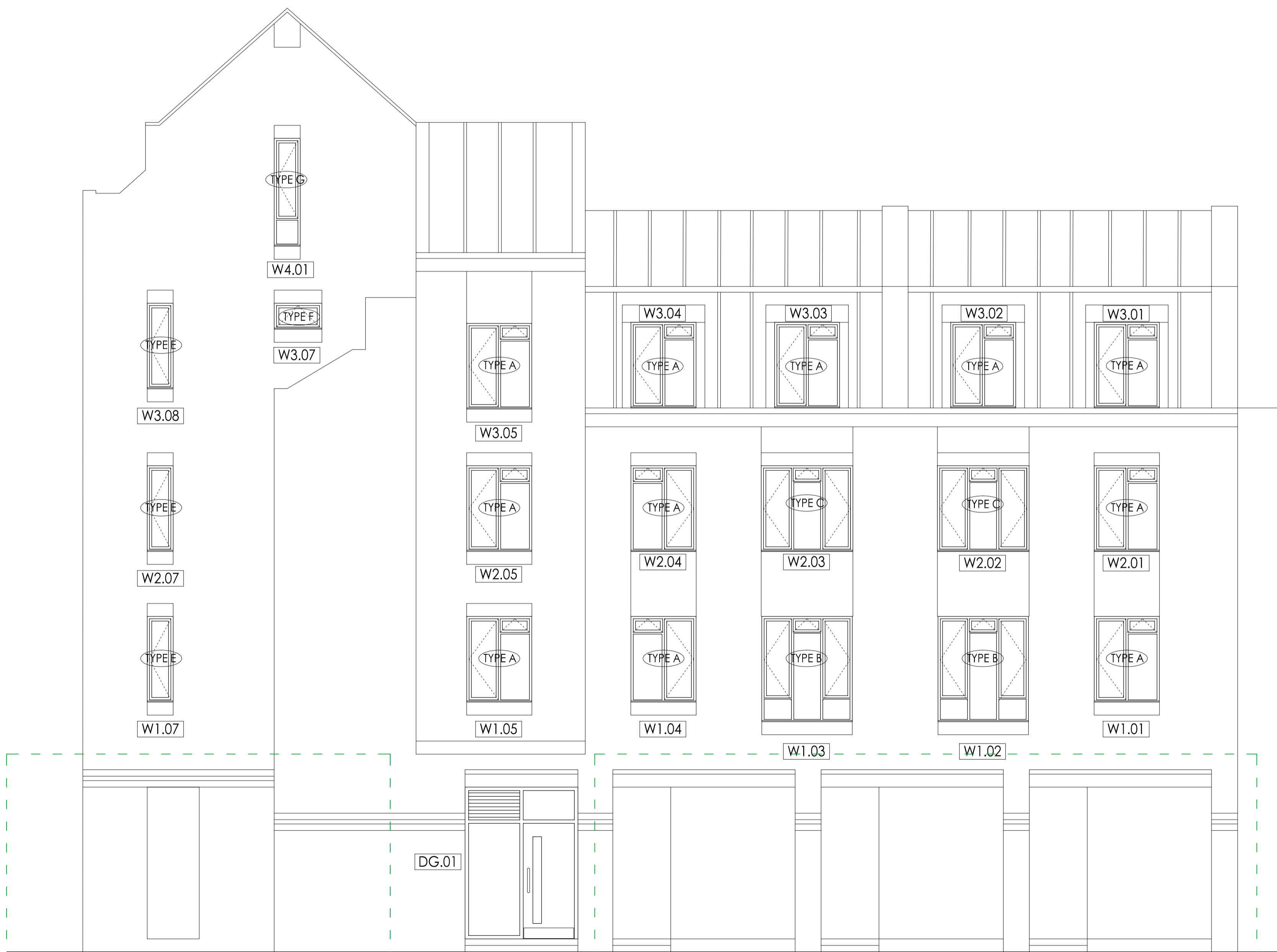
EXISTING ELEVATION A SCALE 1:50 @ A1