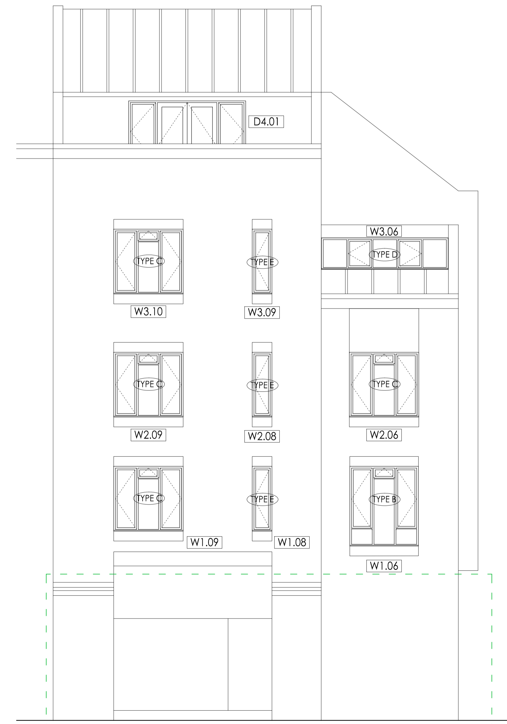
EXISTING ELEVATION B SCALE 1:50 @ A1