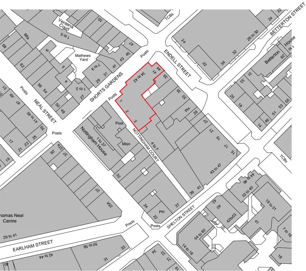
SITE PLAN SCALE 1:1250 @ A3