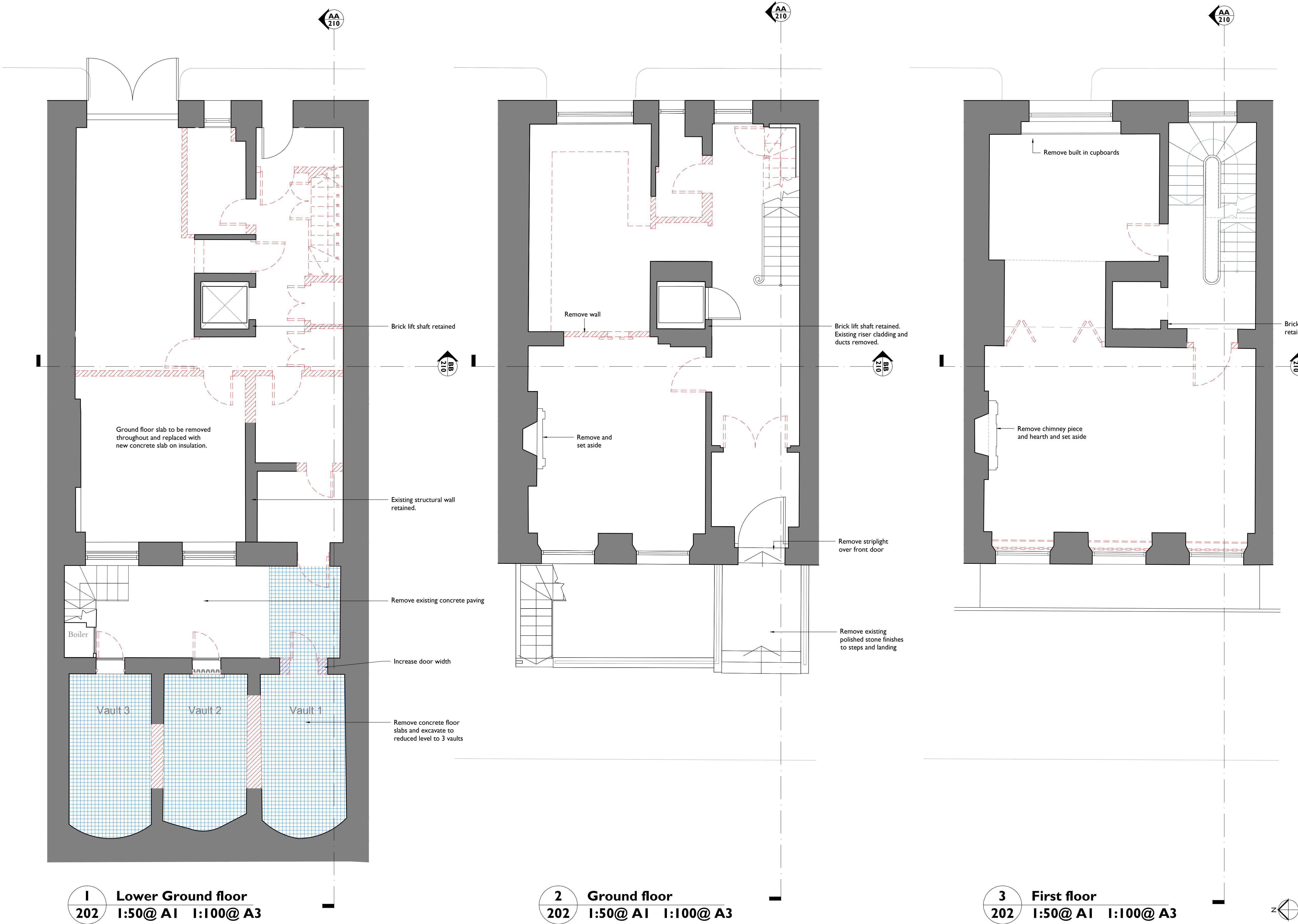
1 202 Lower Ground floor 1:50@ A1 1:100@ A3