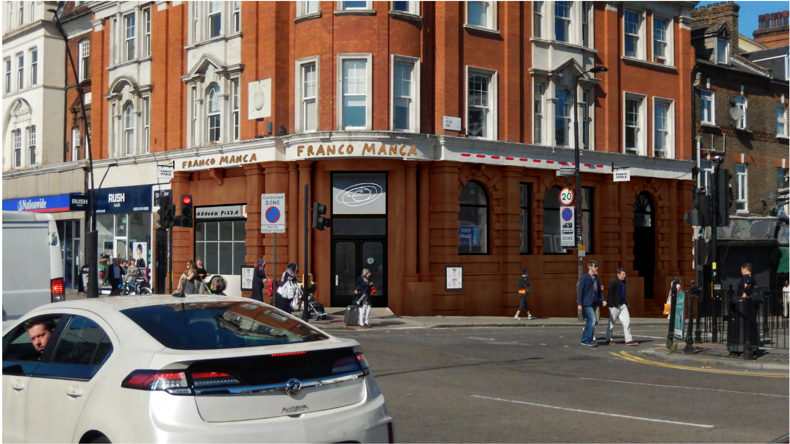
Proposed: Timber plank letters fixed on spacers to fascias. Two externally illuminated projection signs. Two internally illuminated A2 menu boxes.