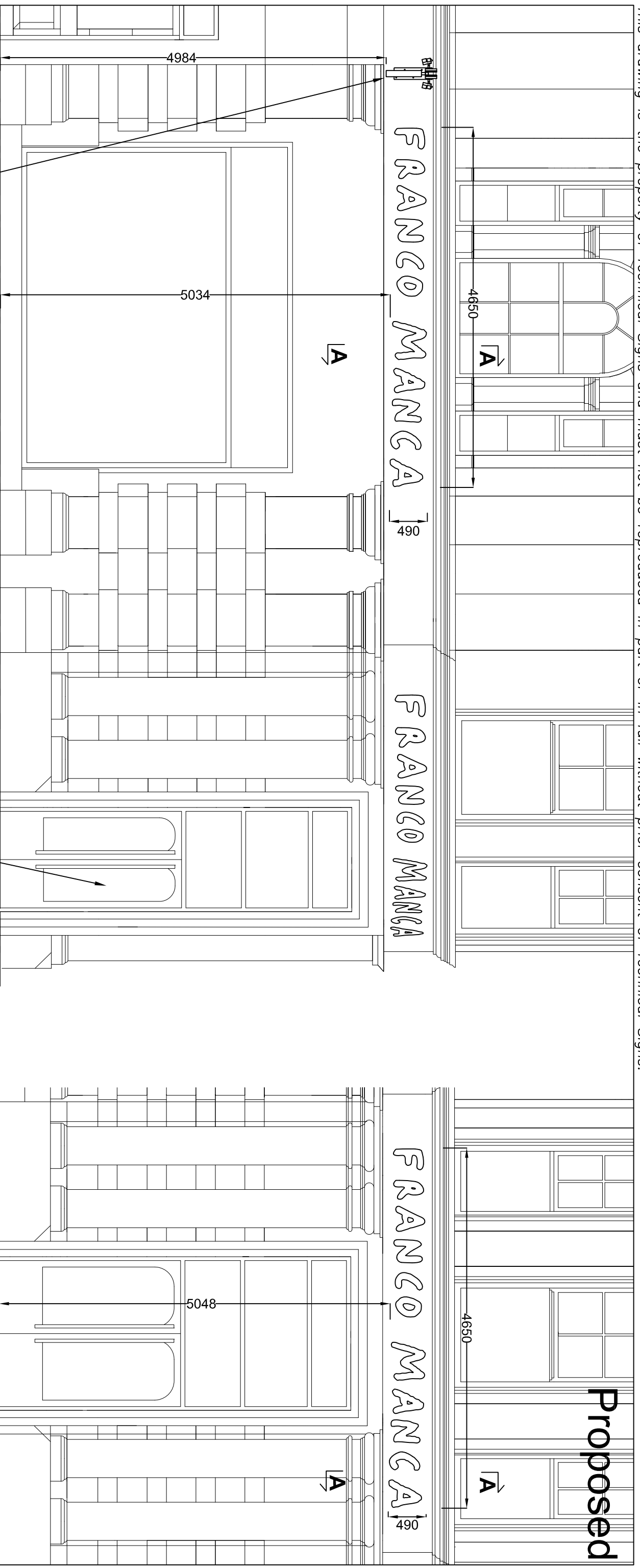
Kilburn High Rd Elevation Scale 1:50