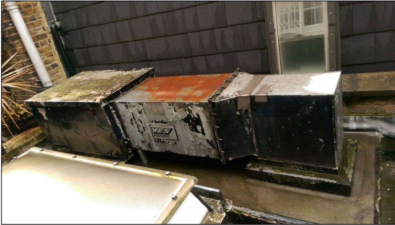
IMAGE 01- EXTRACTION UNIT AS PRE-EXISTED