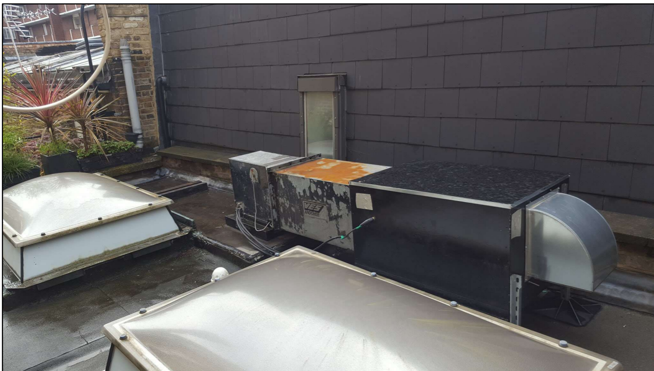
IMAGE 03- EXTRACTION UNIT AS EXISTING