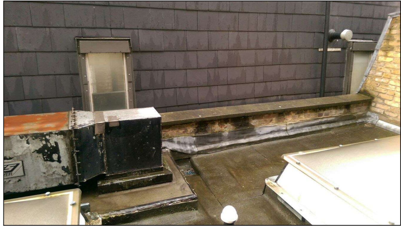
IMAGE 02- EXTRACTION UNIT AS PRE-EXISTED