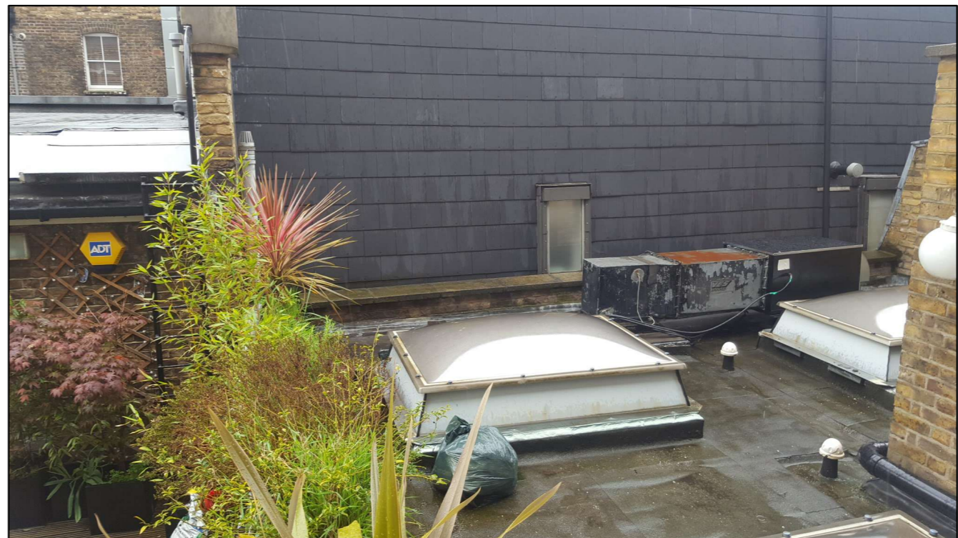
IMAGE 04- EXTRACTION UNIT AS EXISTING

NOTE: THE PREVIOUSLY EXISTED EXTRACTION UNIT HAS ONLY BEEN ROTATED, THERE IS NO ANY OTHER ACTION TAKEN.