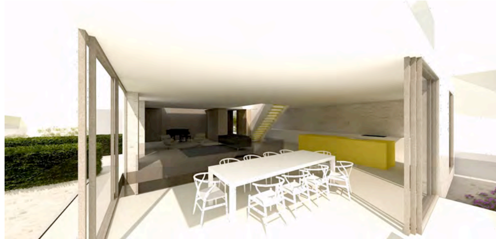
View from upper terrace towards kitchen and dining areas