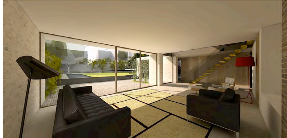
View from main living area towards gardens