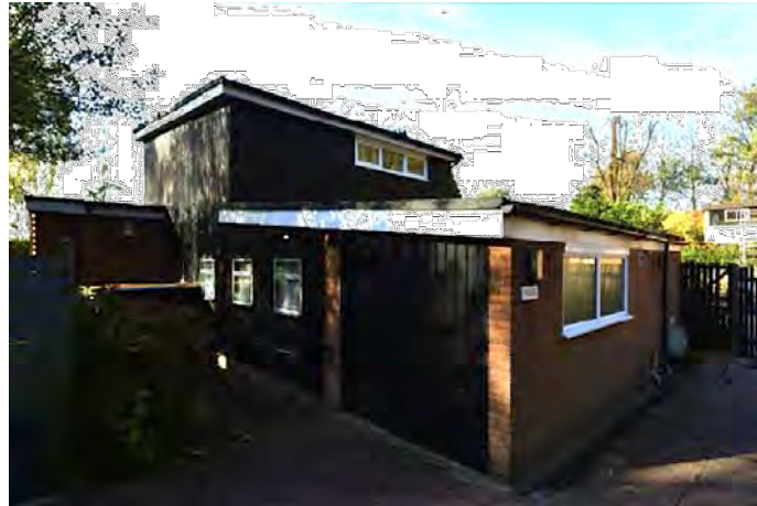
View of existing entrance