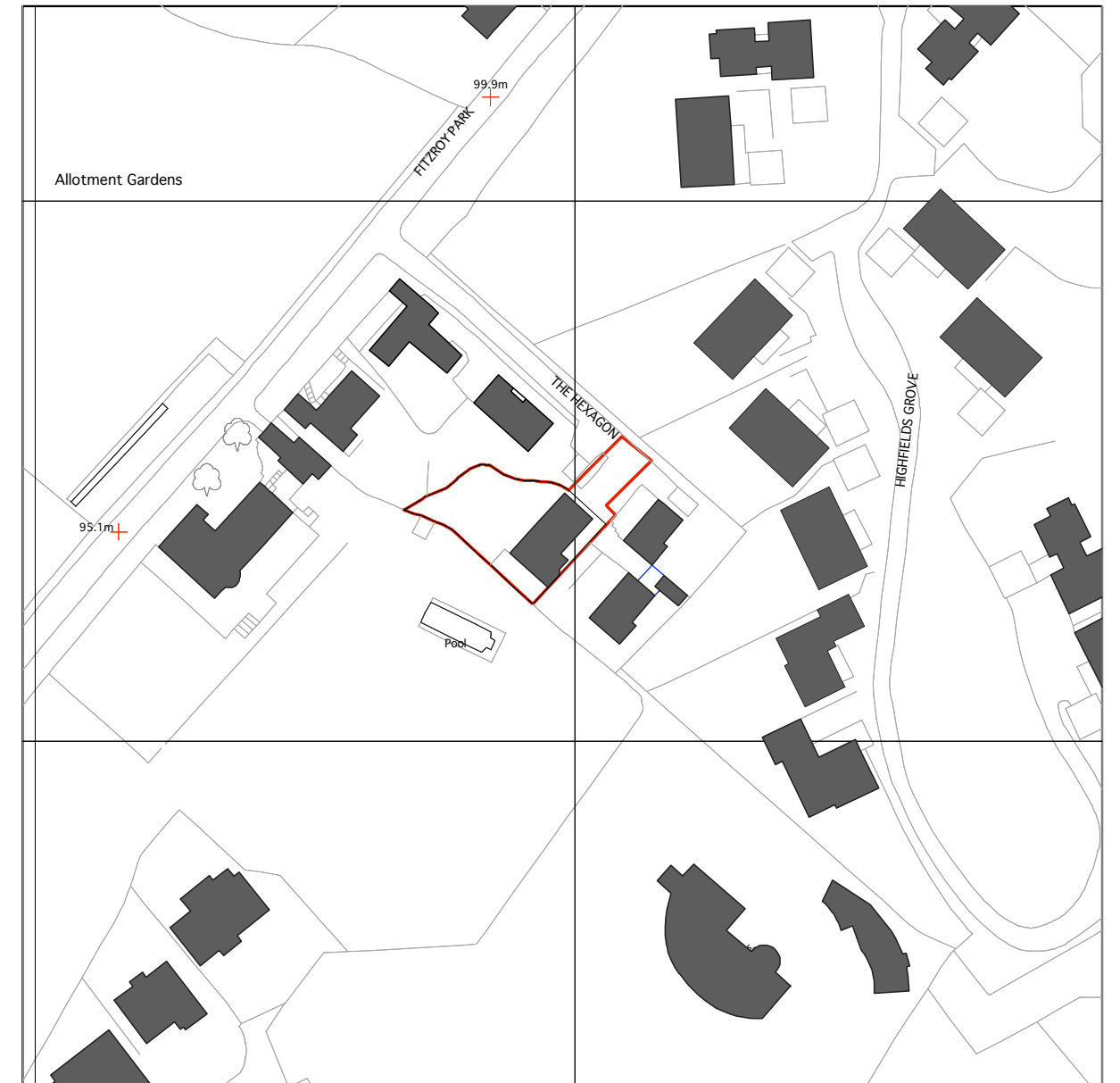
EXISTING SITE PLAN SCALE 1:1250@A3