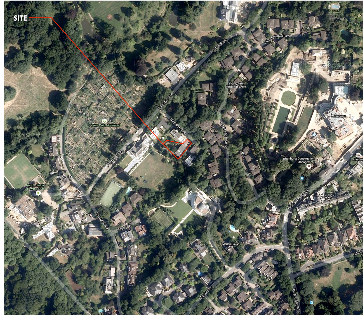
AERIAL VIEW