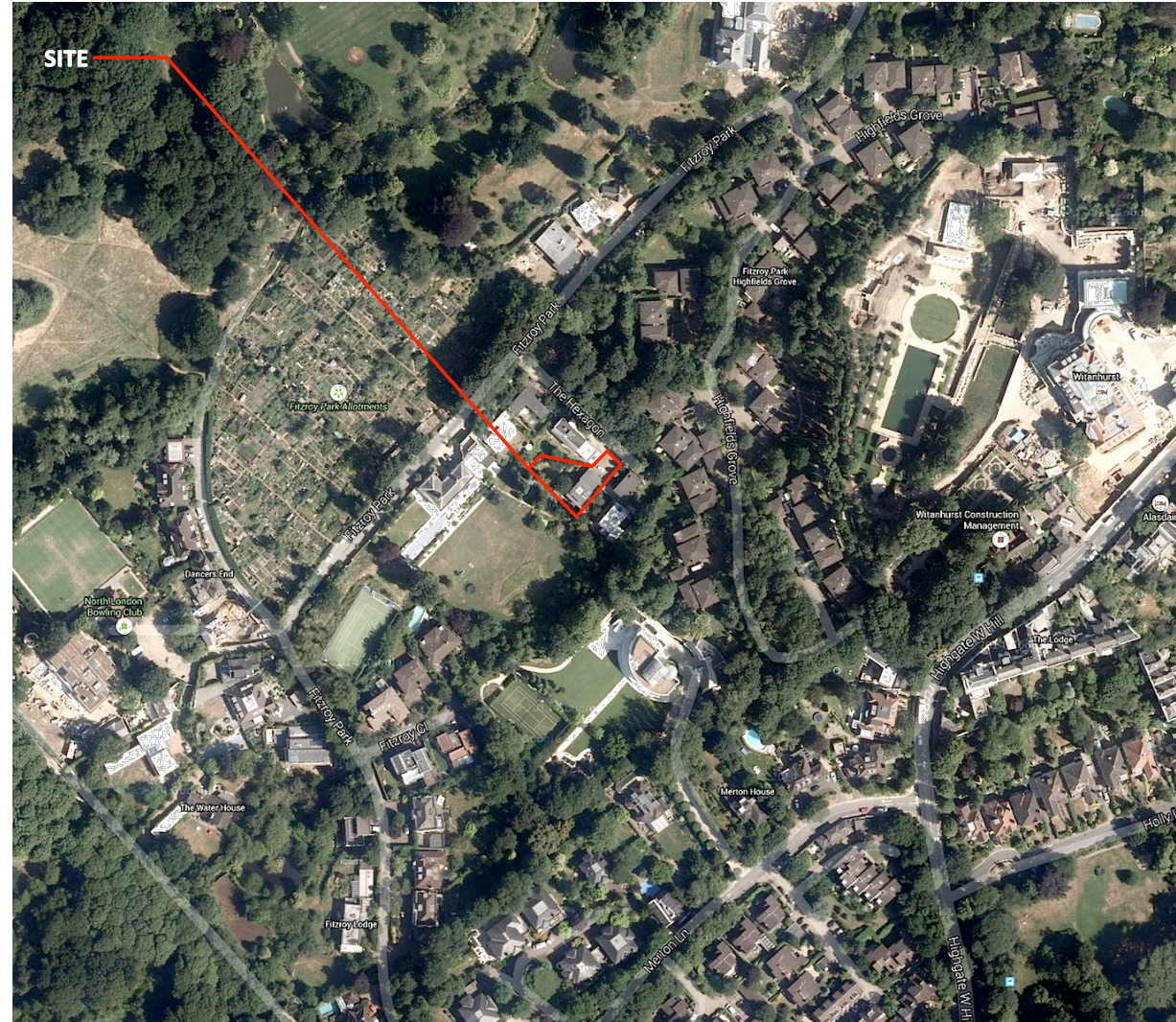
AERIAL VIEW