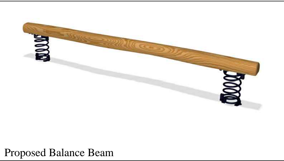
Proposed Balance Beam