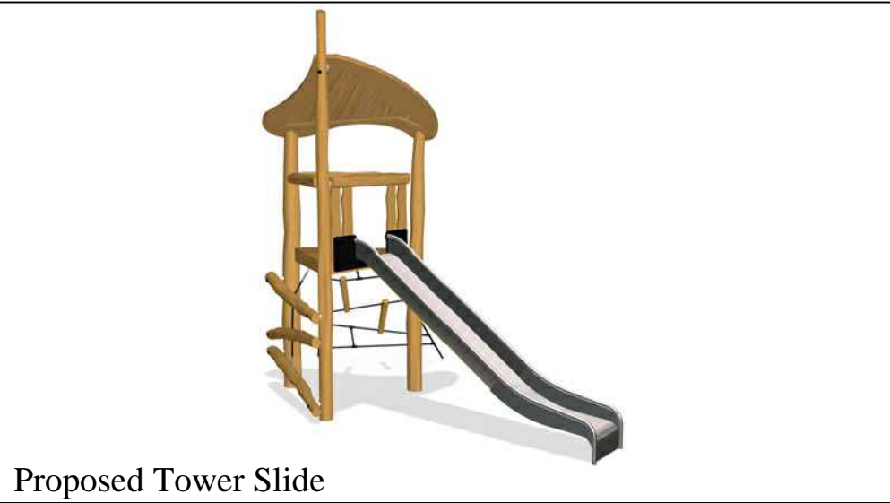
Proposed Tower Slide

Images of proposed play equipment, as supplied by kompan or similar