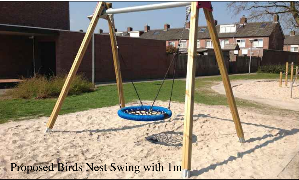
Proposed Birds Nest Swing with 1m