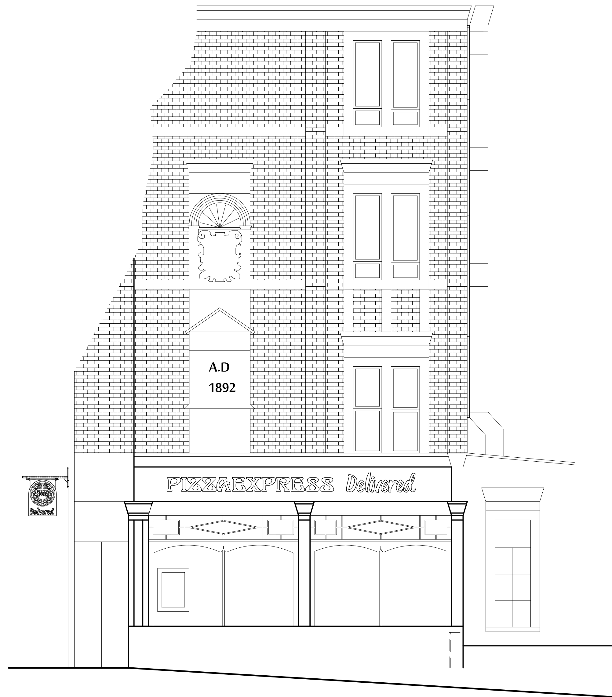
03 EXISTING SIDE ELEVATION 02 SCALE 1:50