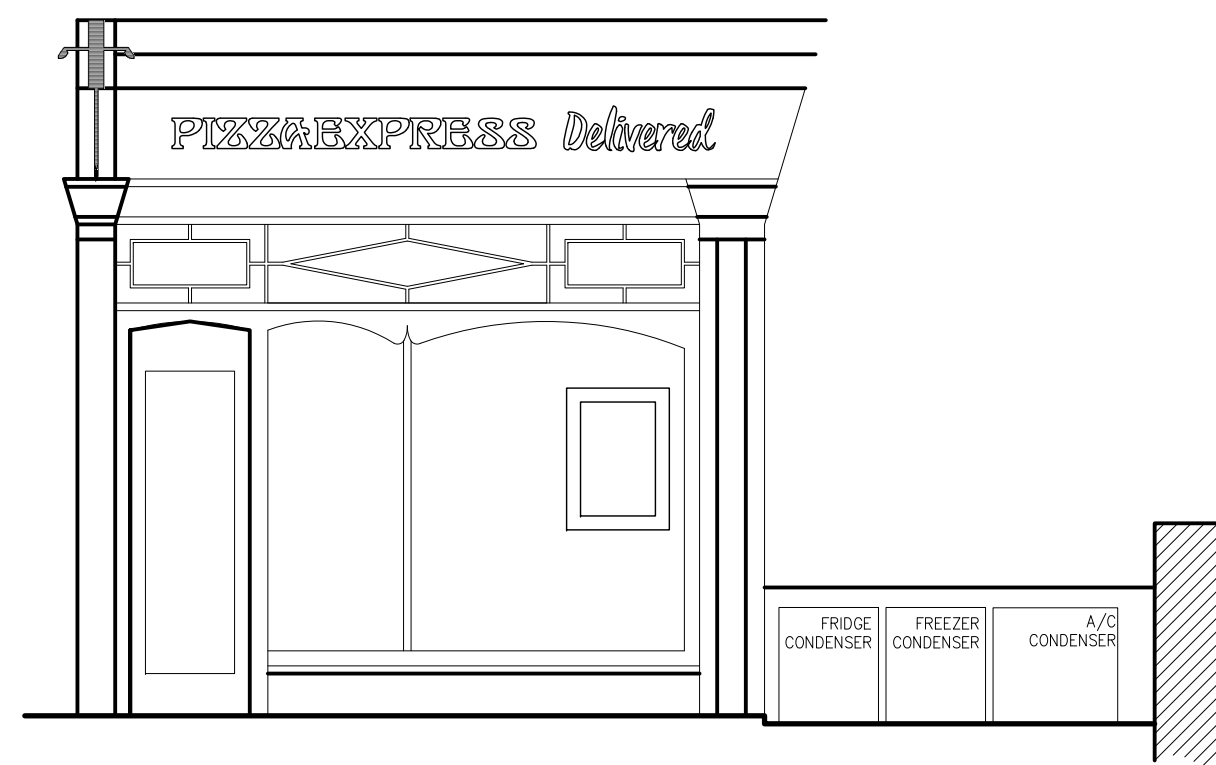
01 EXISTING SIDE ELEVATION 02 SCALE 1:50