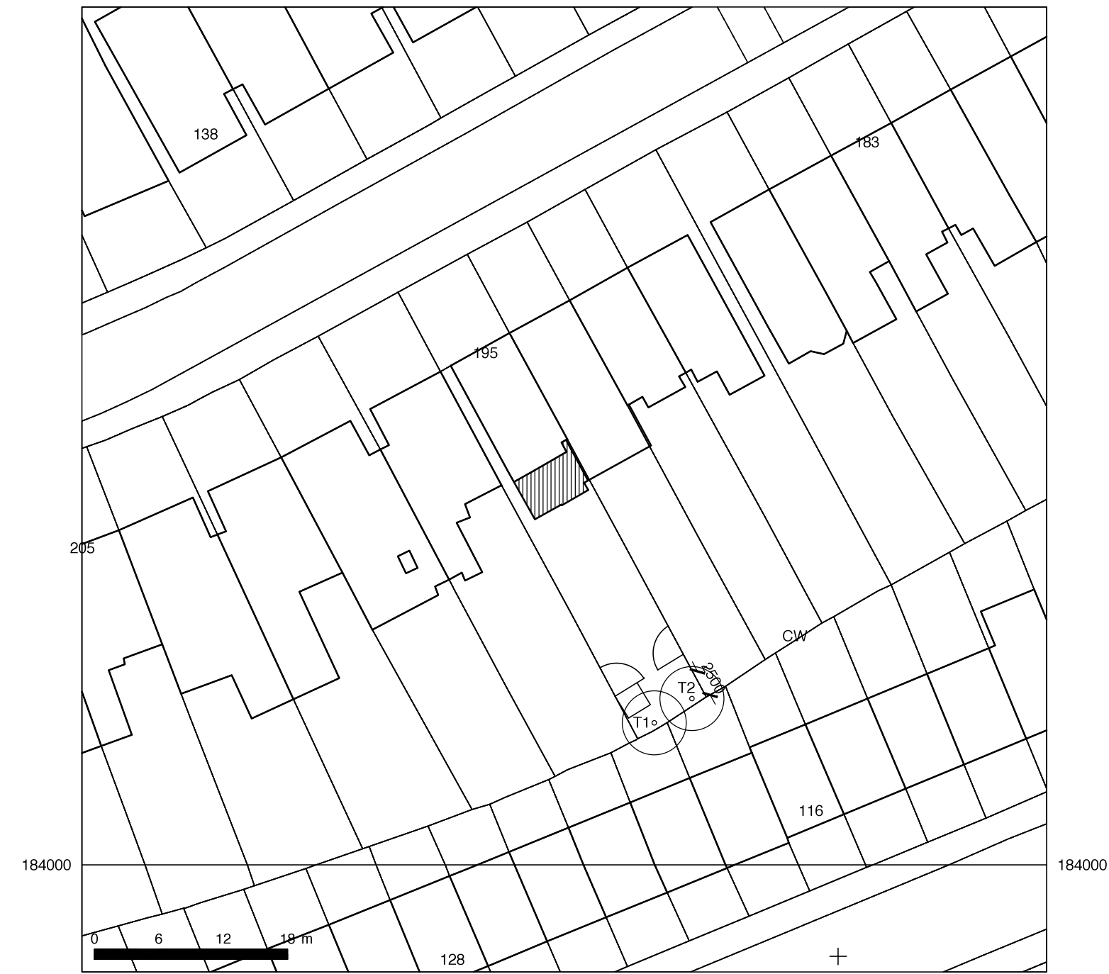
PROPOSED SITE/BLOCK PLAN 1:500