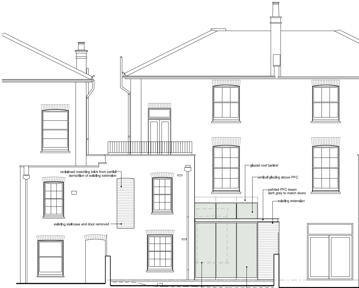
02 Proposed East Elevation 1:50@ A1 / 1:100@A3