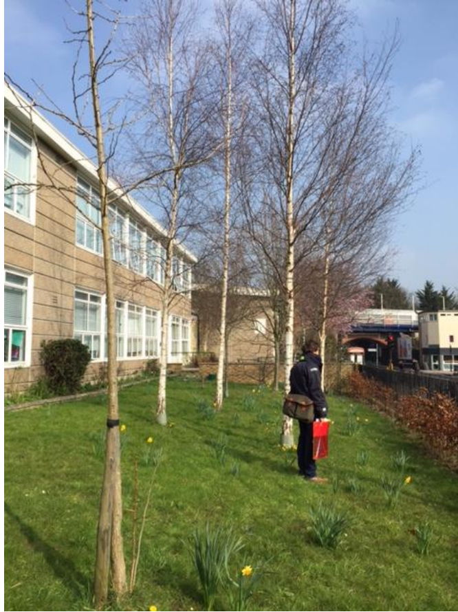
Photo 3: Existing trees to be removed and proposed location of new access ramp