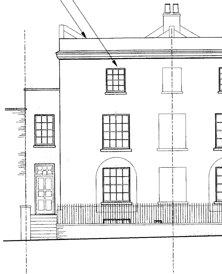
EXISTING & PROPOSED FRONT ELEVATION (As viewed from street)