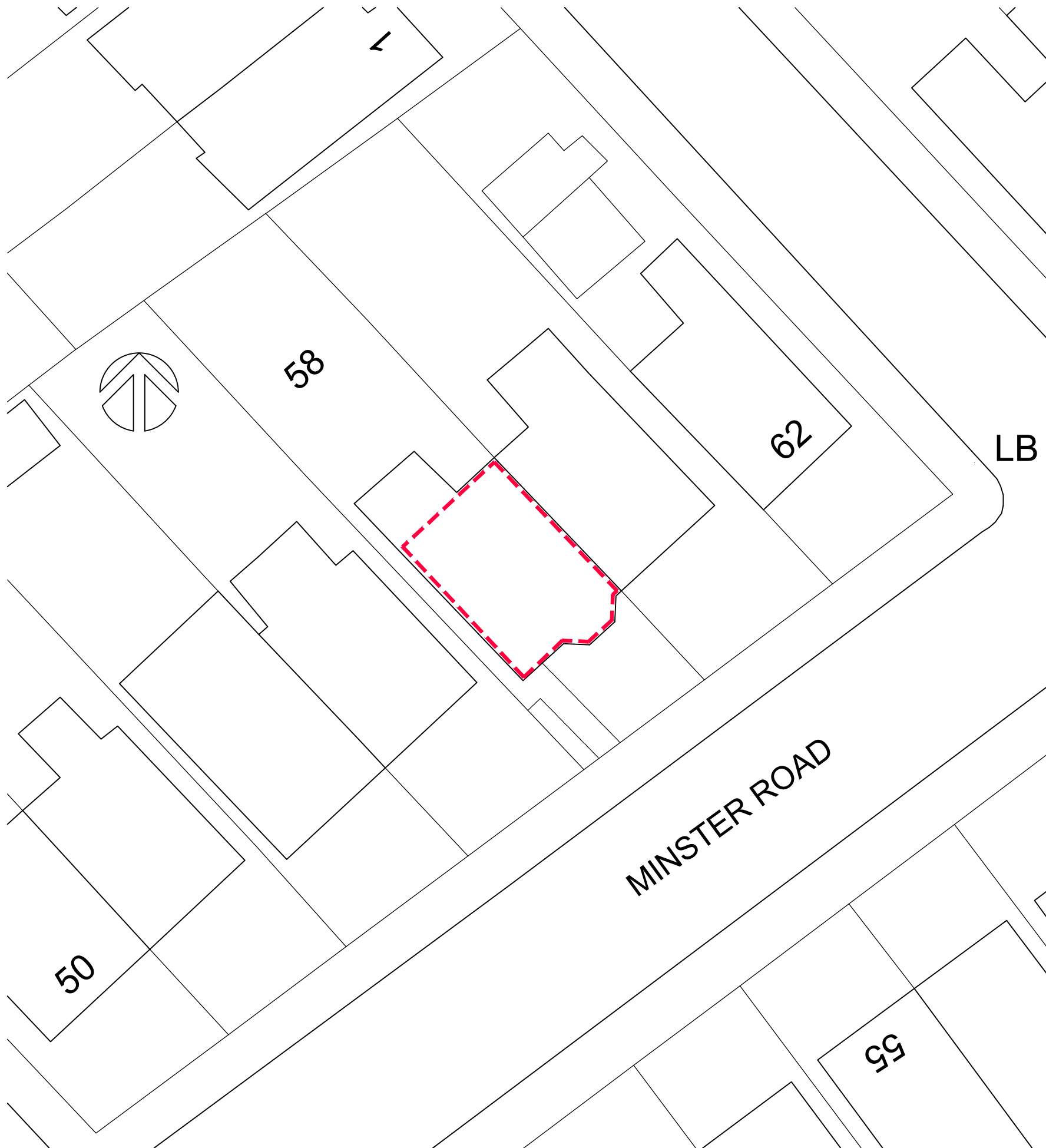
SITE PLAN Scale 1:250@A3