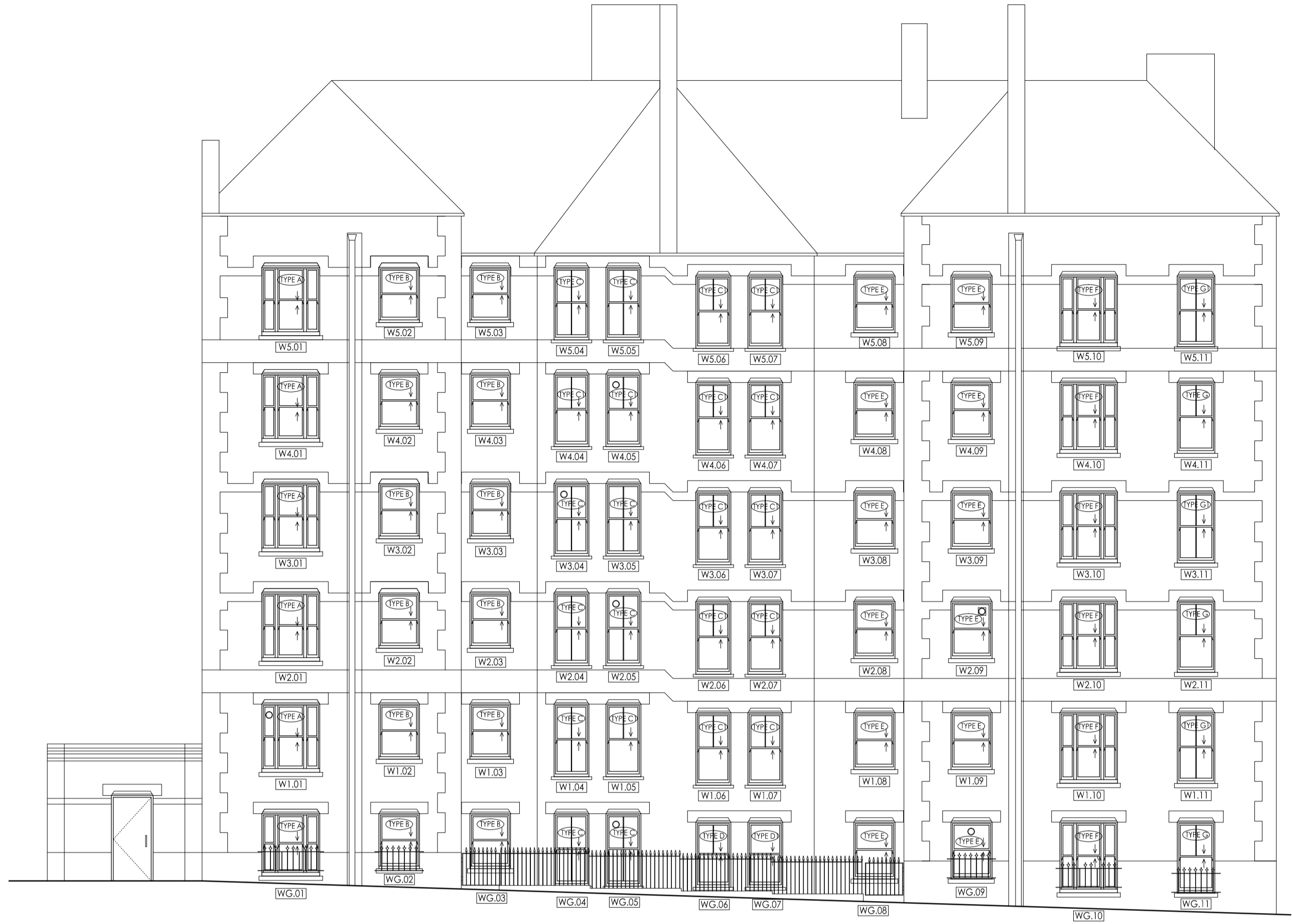
EXISTING ELEVATION A SCALE 1:100 @ A1