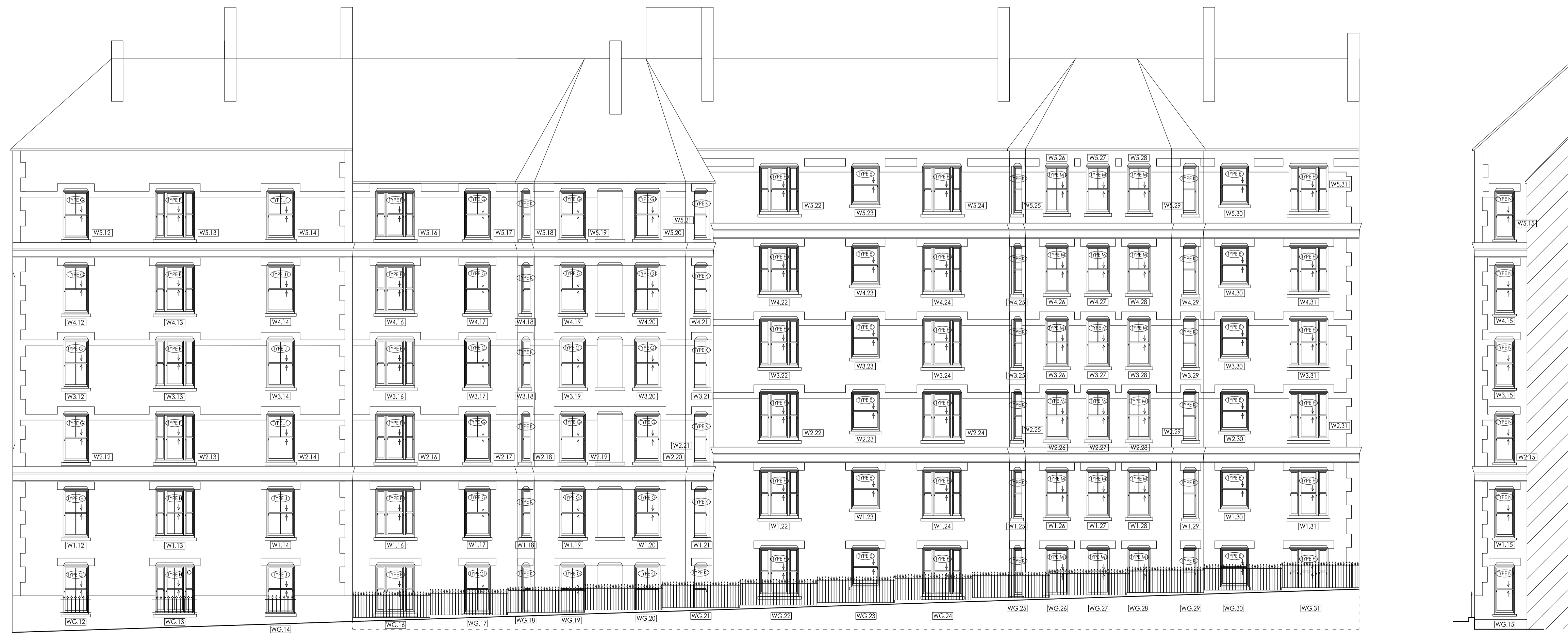
EXISTING ELEVATION B SCALE 1:100 @ A1