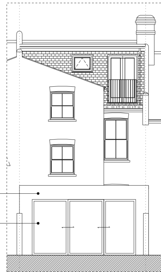
02 PROPOSED REAR ELEVATION 01-200 1:100 @ A3