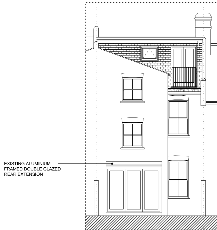
01 EXISTING REAR ELEVATION 02-100 1:100 @ A3