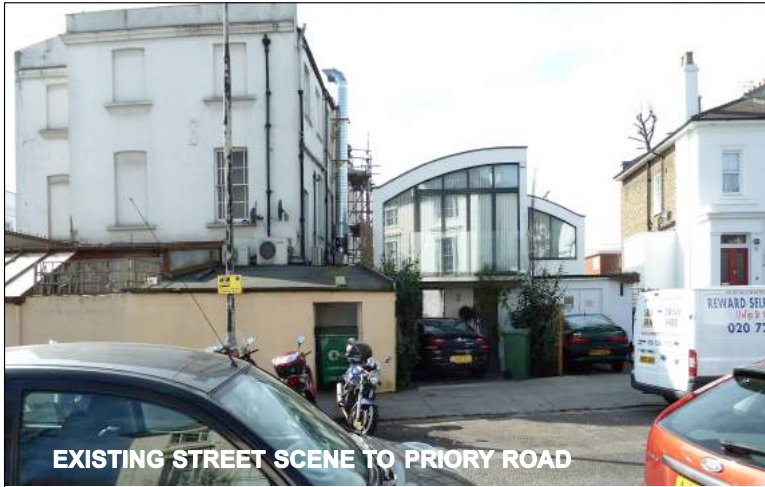
EXISTING STREET SCENE TO PRIORY ROAD