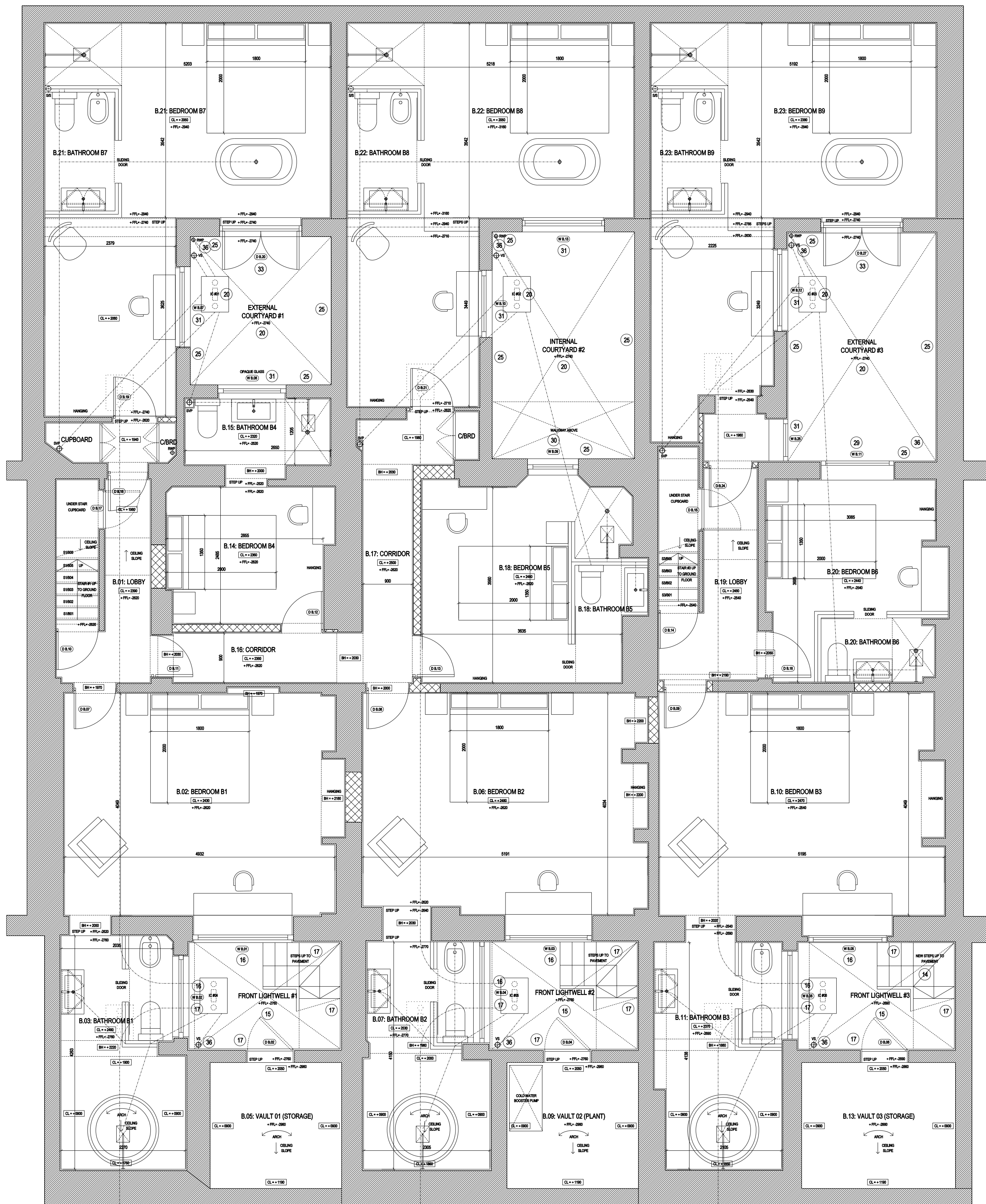
01 PROPOSED LOWER GROUND FLOOR: GENERAL ARRANGEMENT PLAN 01 Scale 1:50 (@A1 SIZE)