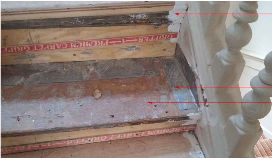
Existing levelling to Staircase