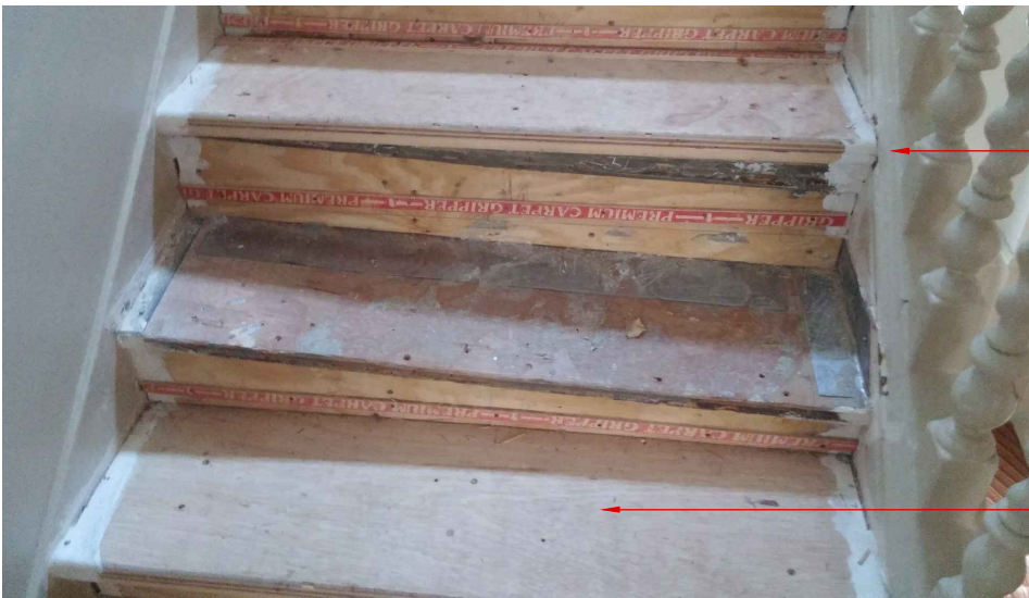
Existing levelling to Staircase