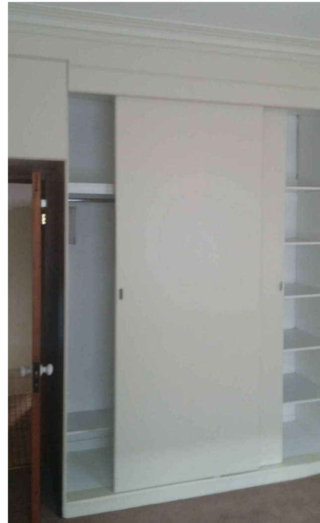
Existing Not currently in use