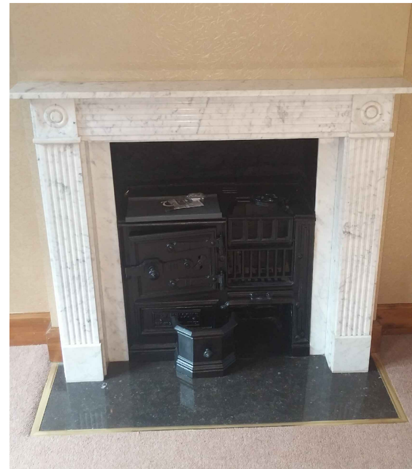
Existing Non original fireplace