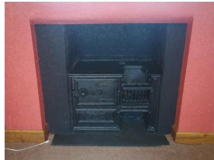
Existing Non original insert