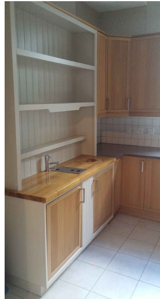
Existing Currently no fireplace in use