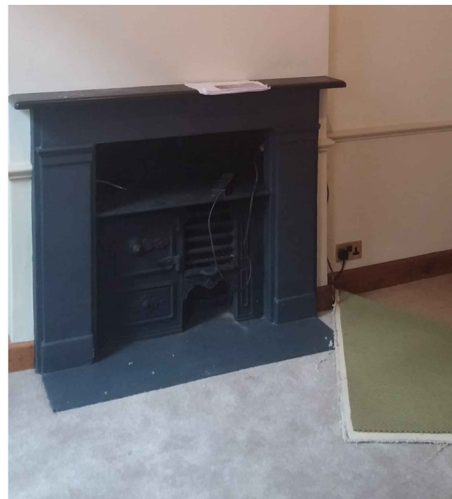
Existing Non original Fireplace