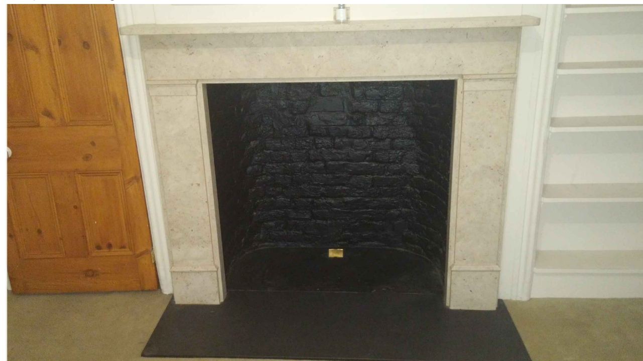
Existing Non original Fireplace