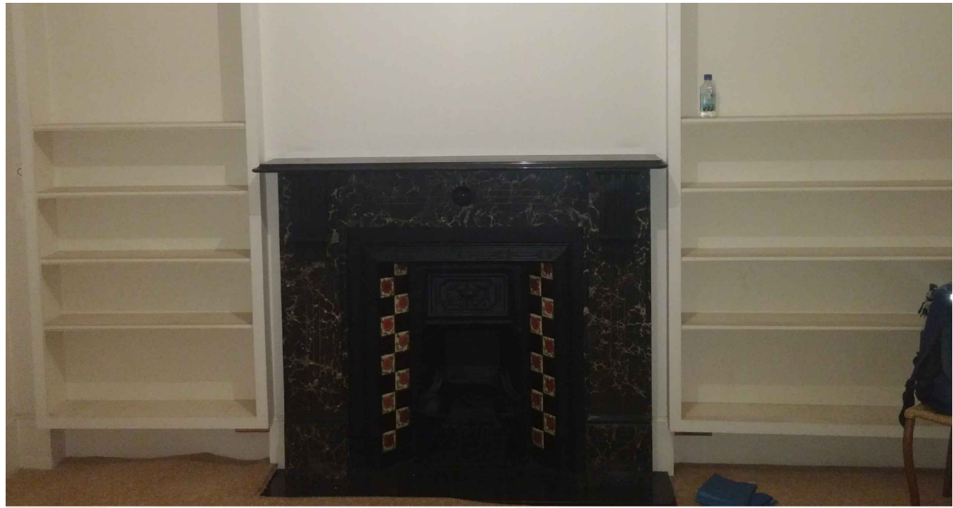
Existing Non Original Fireplace