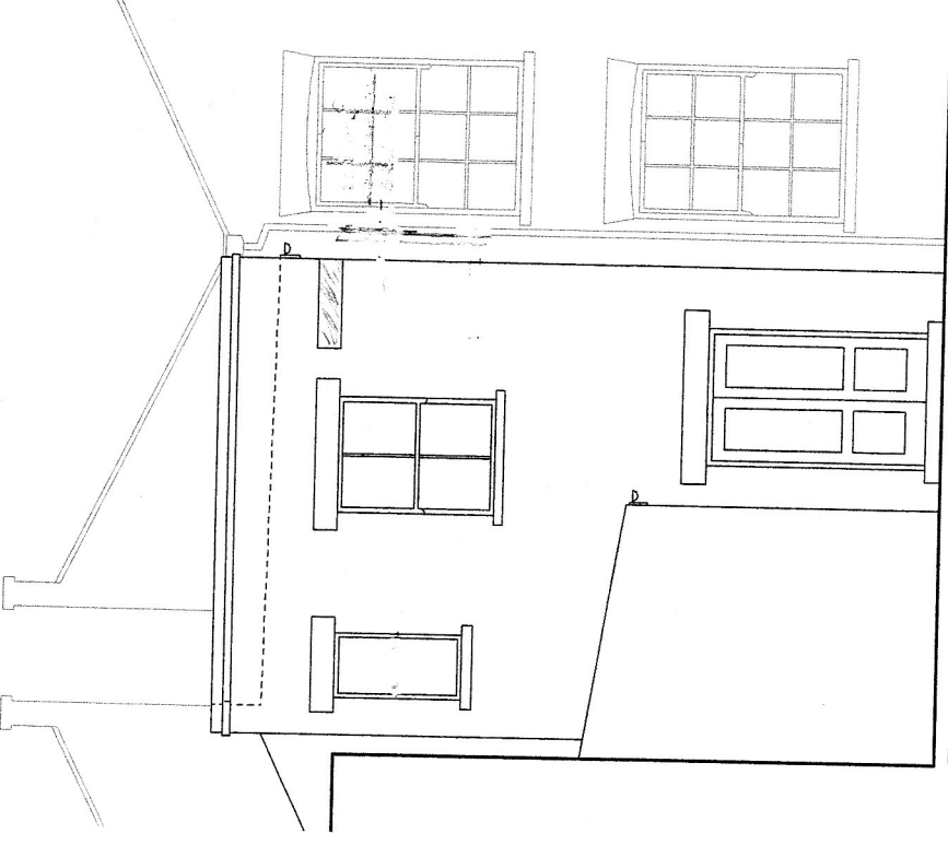
ELEVATION B (scale 1:50 @ A3)