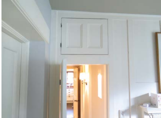
Image 15 - Connecting door between dining room and entrance hallway to be raised.

Chestnut Cottage, Vale of Heath, London, NW3 1AZ