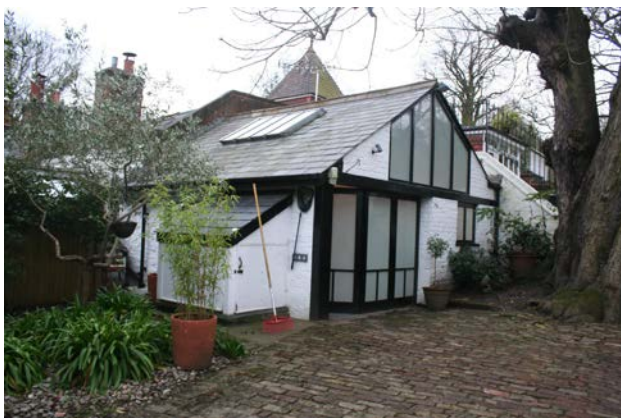
Image 21 - Brick paving around garage and chestnut tree to be relaid.