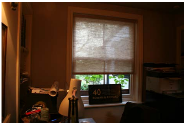
Image 14 - Ground floor entrance hallway east elevation window to be removed for opening into winter garden room.

Non original garage/annex to be reconfigured as guest space and to include kitchenette, shower room and mezzanine sleeping level, window to east elevation to be removed for new bike store and insulation to roof. Internal finishes to be new timber sprung floor, painted brick and stained plywood.