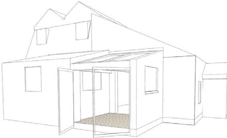
Image 5 – External perspective view of the new winter garden room extension, new brick wall to match existing, glazed double doors, obscured glazing rooflights and timber floor finish.

Chestnut Cottage, Vale of Heath, London, NW3 1AZ