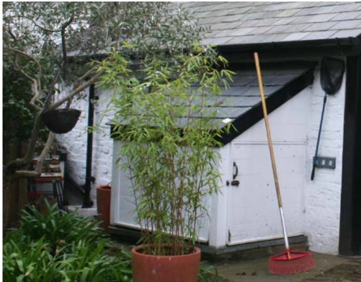
Image 7 - Existing store to be removed and replaced with new log and bike store to match existing.

This is a small single storey extension with pitched roof, measuring 1.1x4.2m i.e 4.62m 2 . External walls are to be painted brick to match existing and slate roof to match existing as illustrated in image 7. Doors are to be painted T&G timber to match existing. Internal finishes are stone tile floor, painted plaster and brick walls and painted plaster ceiling.