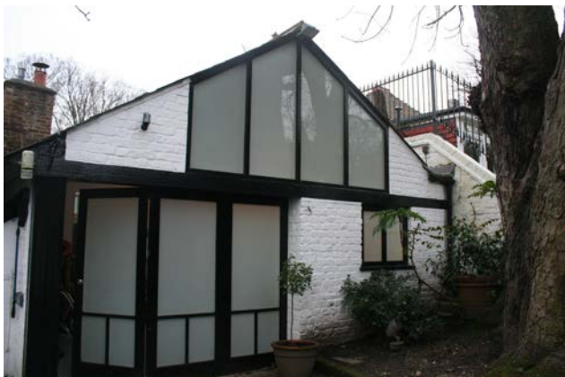
Image 13 - Garage/Annex sliding entrance doors and window to be replaced to match existing.