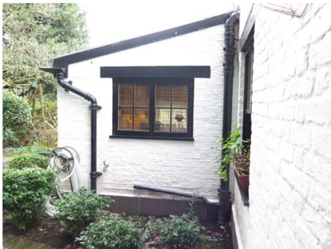
Image 4 - Existing kitchen north elevation white painted brick and painted timber with existing window to be echoed in new winter garden room north elevation wall.

This is a small single storey extension with pitched roof, measuring 2x1.9m i.e 3.8m 2 . The external north elevation wall is to be white painted brick of the same size, form and material of the kitchen north wall, shown in image 4. It will have a window of a similar location to the existing kitchen window. There will be new glazed double doors opening out onto the garden and obscured glazing panels on the roof. Internal finishes are dark painted timber and painted plaster. Image 5 shows an external perspective view of the new extension and image 6 shows an internal perspective view of the new extension.