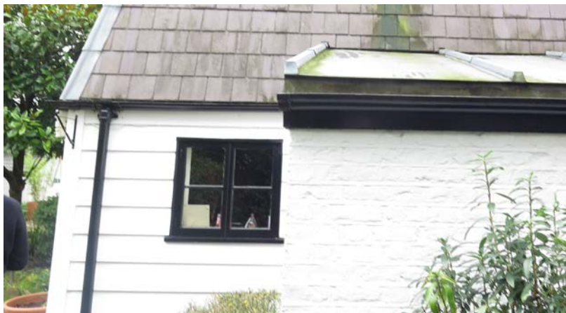
Image 9 – New ground floor study east elevation existing window cill to be lowered