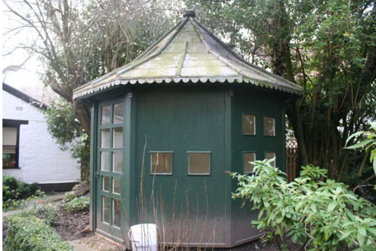
Image 22 - Glazing in non original summer house to be replaced

Chestnut Cottage, Vale of Heath, London, NW3 1AZ