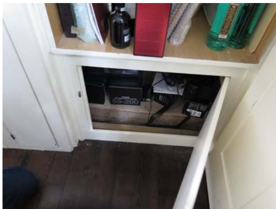
Image 16 - Ground floor redundant staircase to be removed and replaced with storage.