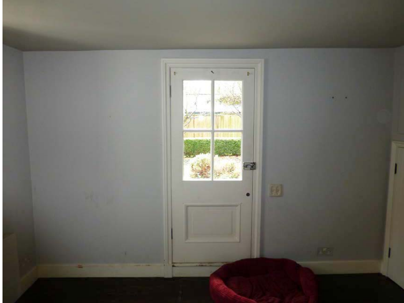
Image 8 - New window opening proposed east of glazed door

Chestnut Cottage, Vale of Heath, London, NW3 1AZ