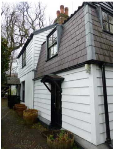
Image 20 - Existing rear canopy