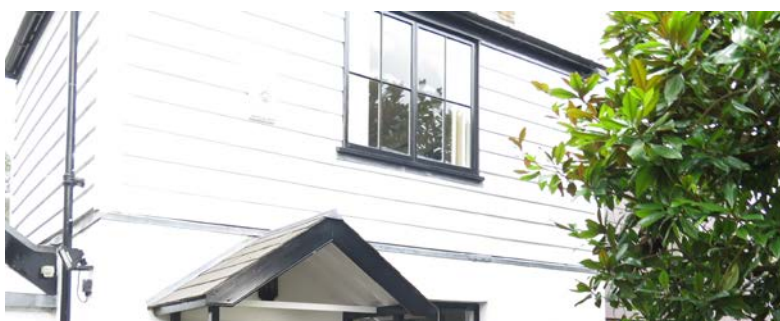
Image 10 - Bedroom 1 south elevation window to be replaced to match existing