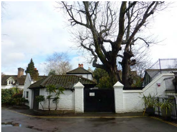
Image 18 - Main vehicle gate to be widened by 220mm and gate replaced with new black painted T&G gate to match existing. Gate to be single hinged 3 part folding gate.

Non original side entrance canopy on north elevation, shown in image 19, is to be replaced with a new canopy to match existing rear canopy, as shown in image 20, and new canopy to main entrance to match existing rear entrance canopy as shown in image 20. New small boot wash sink and dog wash area are to be located nearby the side entrance on the north elevation. Brick paving around garage and chestnut tree, as shown in image 21, is to be relaid. Additional external storage is to be provided by a 2m x 3m shed located in the south eastern part of the site and the glazing in the non-original summer house as shown in image 22, is to be replaced.