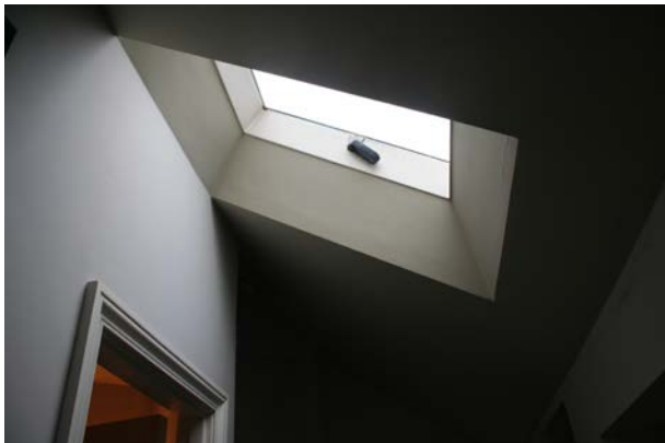
Image 12 - Fixed rooflight in first floor landing to be replaced with central pivot rooflight to match existing.