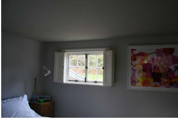
Image 11 - Bedroom 1 north elevation glazing to be replaced with 'Slimlite' double glazed panels

Chestnut Cottage, Vale of Heath, London, NW3 1AZ