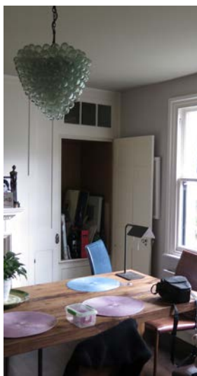
Image 17 - Ground floor redundant staircase to be removed and replaced with storage