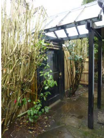
Image 19 - Non original side entrance canopy to be removed and replaced with canopy to match existing rear entrance canopy

Chestnut Cottage, Vale of Heath, London, NW3 1AZ