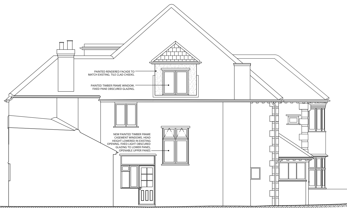
PROPOSED FLANK ELEVATION Scale 1:100