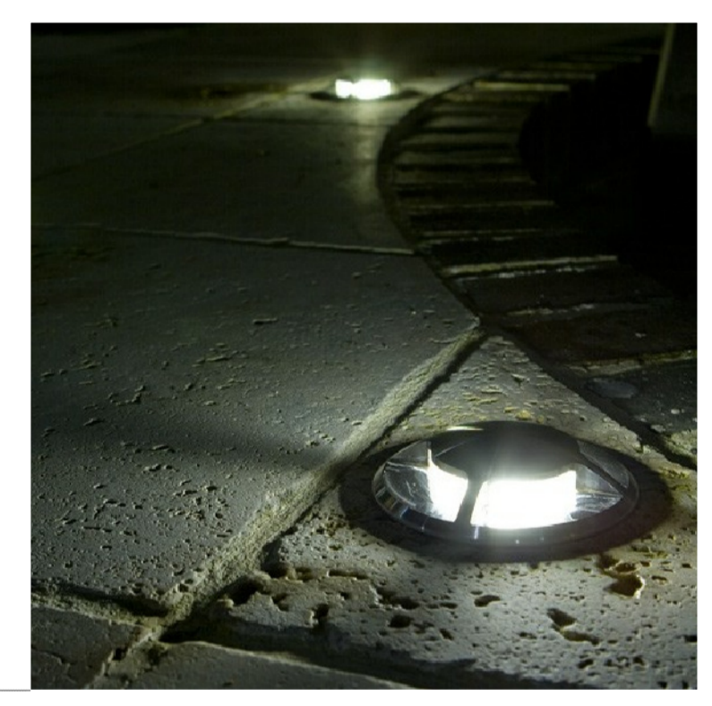
a Proposed road mounted light fitting