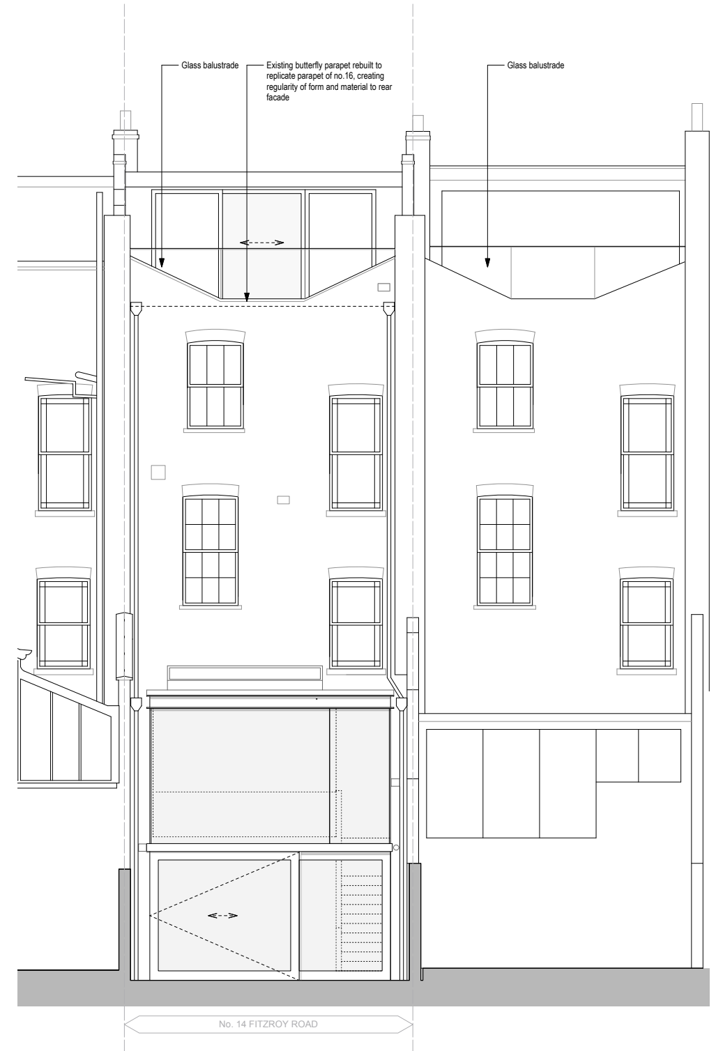
3 Proposed NW Elevation Scale: 1:50

Notes 1. Do not scale from drawing, unless noted otherwise. 2. Dimensions are to be checked on site before any work put in hand. Contractor is to notify Architect if the minimum dimension specified cannot be achieved for any reason. 3. No deviation may be made from the details shown on this drawing without prior permission from the architect. 4. Any discrepancy between this and any other documentation shall be referred immediately to the architects. 5. IF IN DOUBT, ASK.