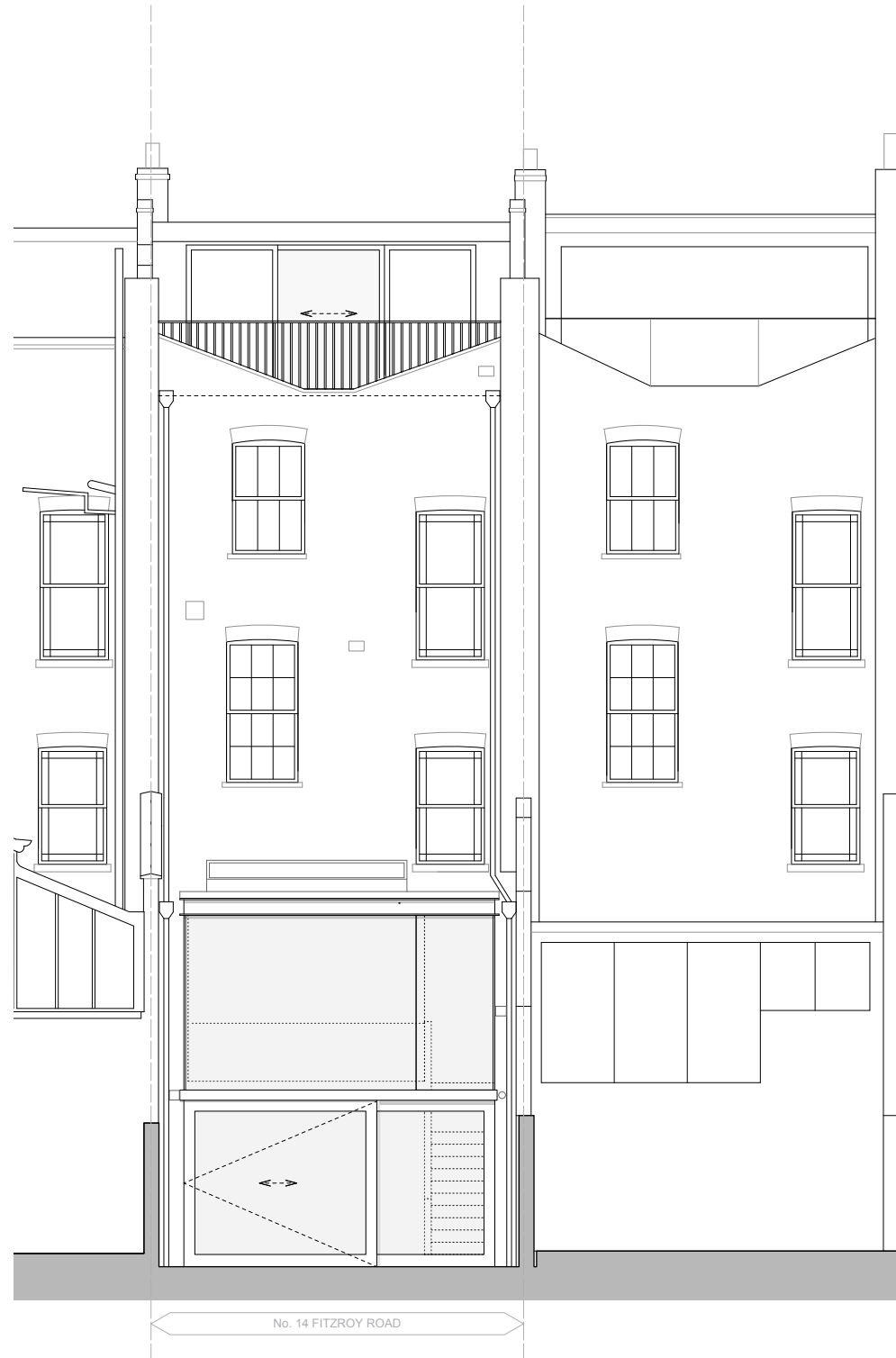
1 Consented NW Elevation Scale: 1:50 Application ref: 2015/5028/P