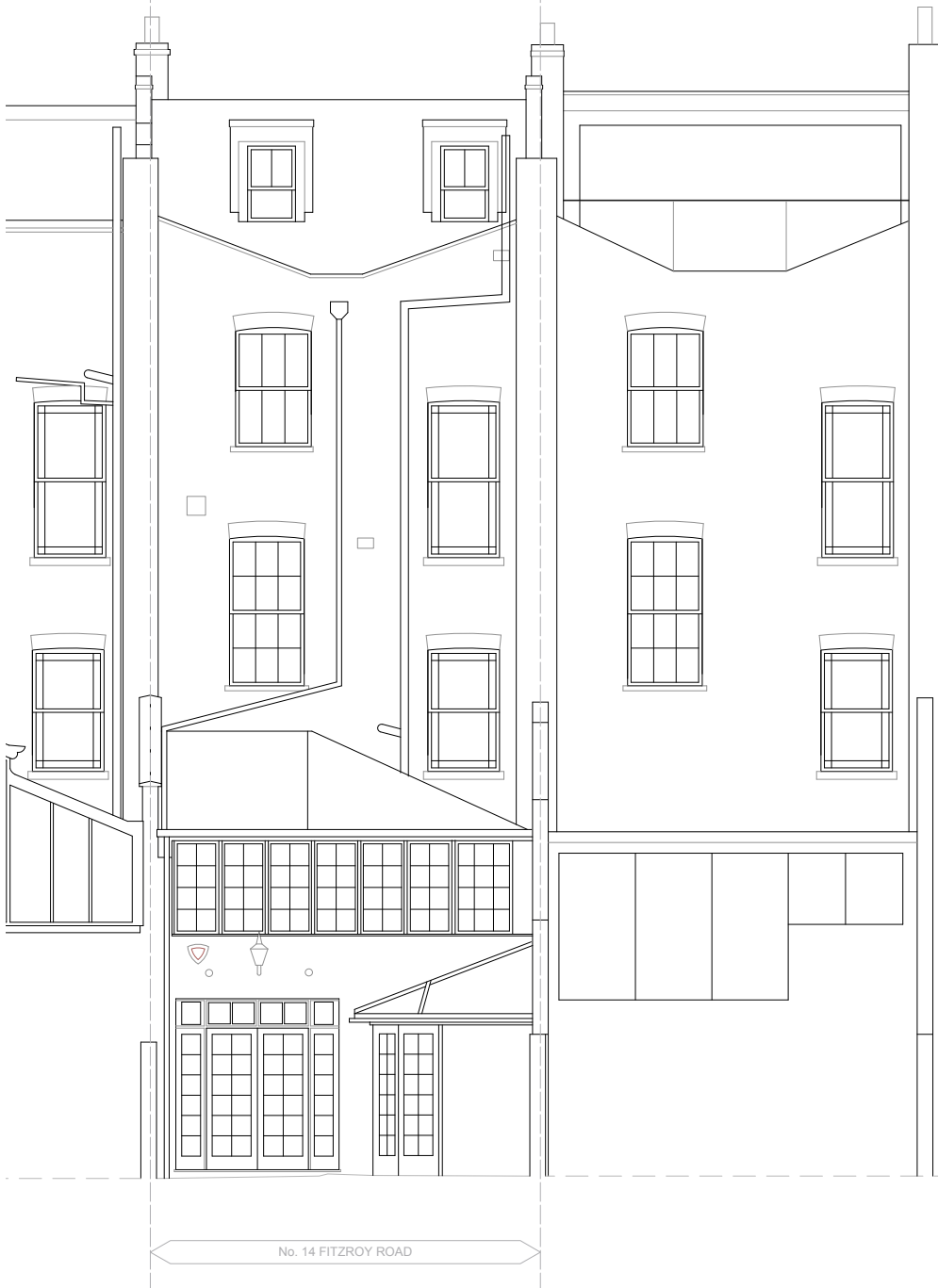
1 Existing NW Elevation Scale: 1:50