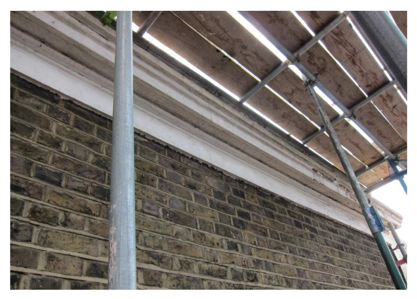
Stucco cornice to street elevation parapet