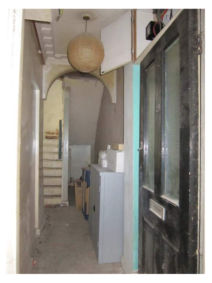
Ground floor – view through secondary entrance doorway towards stairs