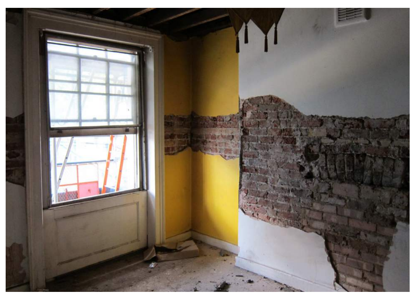
Second floor bedroom facing Camden Road, with secondary glazing