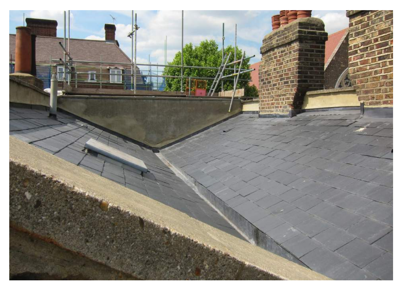
Roof, with replacement roof slates and lead-lined valley gutter