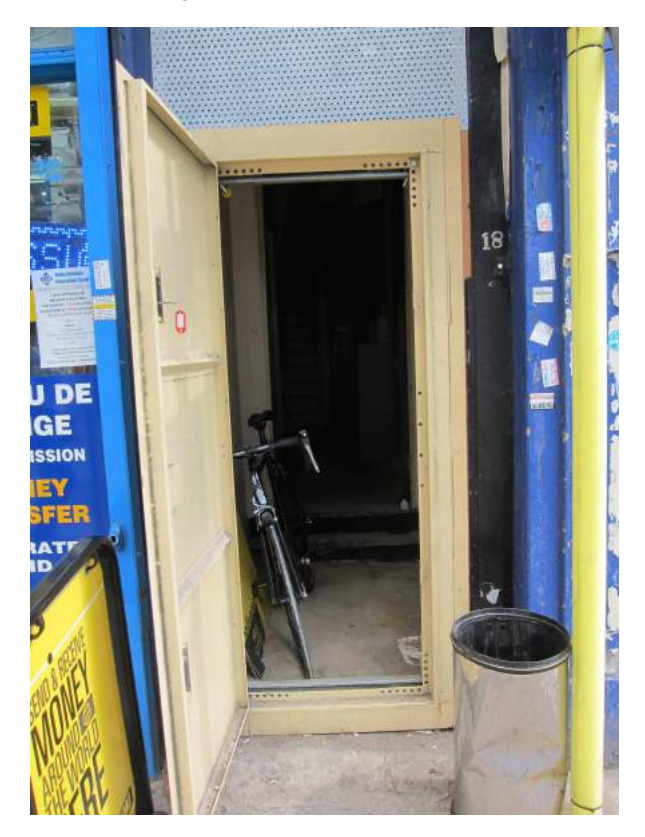
Existing security door to street