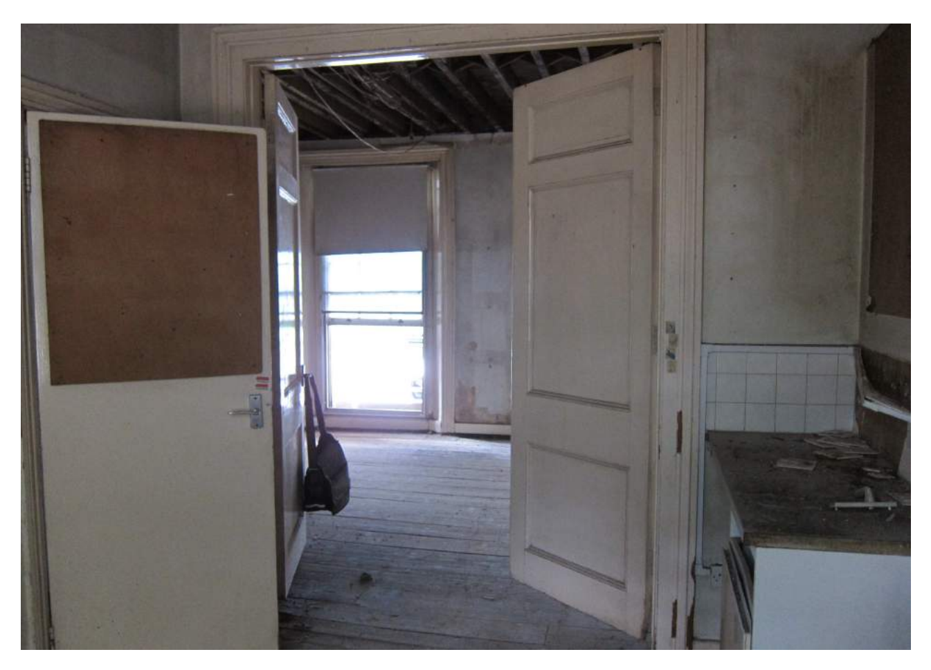
First floor living room from kitchen, with secondary glazing to windows facing street