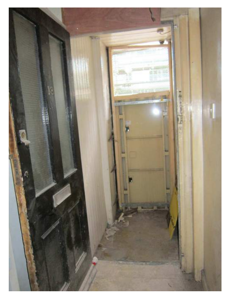
Ground floor – view through secondary entrance doorway towards street door