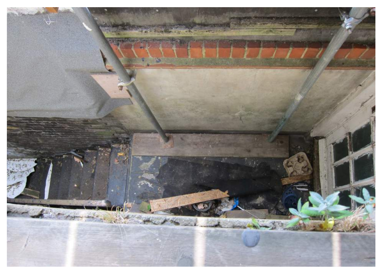
View down into rear area from projecting shop roof, with door to stair on right