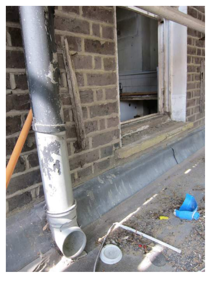
Rear elevation detail - plastic RWP discharges on to projecting shop roof, with window to first floor kitchen behind