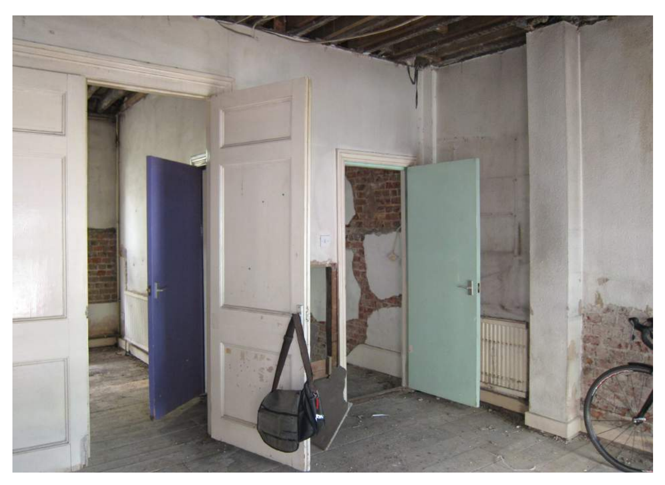
First floor living room, with doors to kitchen on left and stairs on right