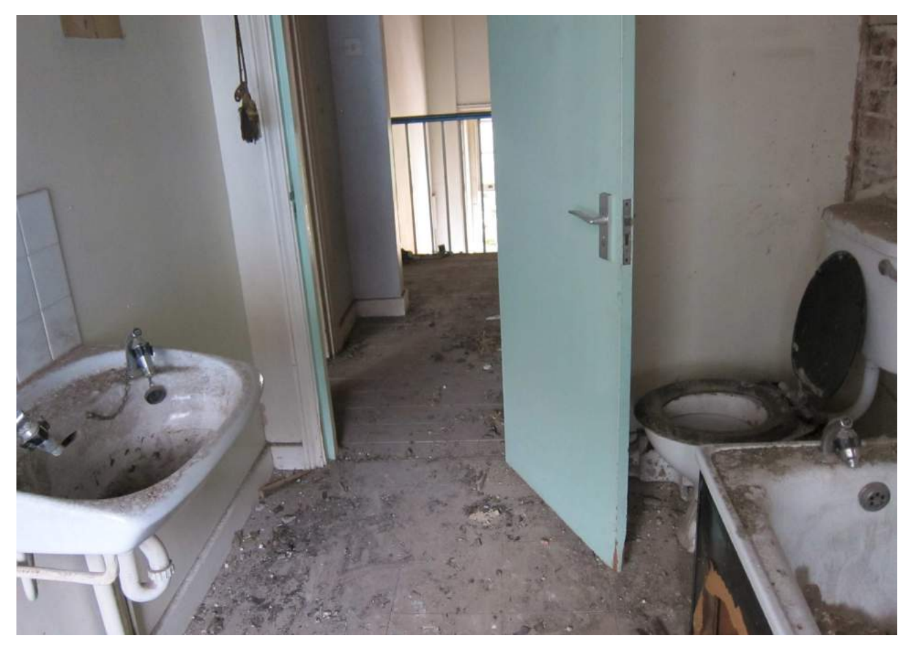
Second floor bathroom - view towards stairs