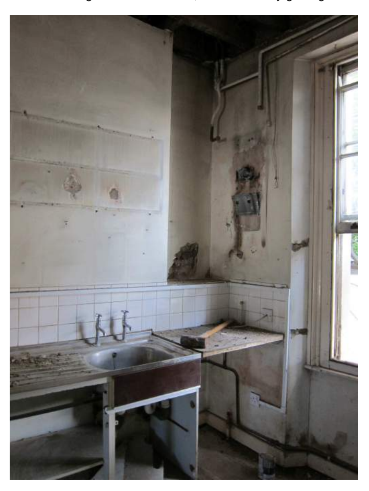
First floor kitchen – wall mounted boiler removed