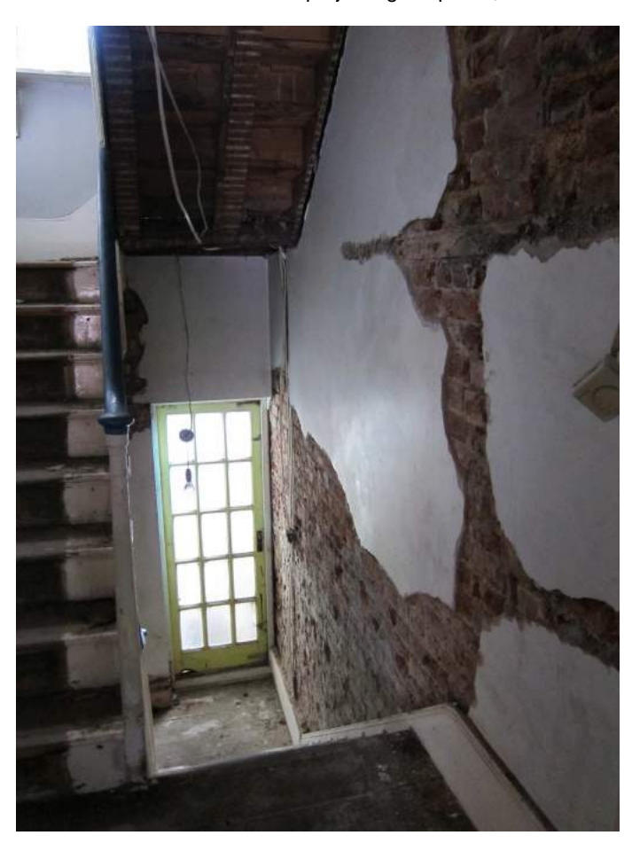
View from first floor stair landing towards rear garden door