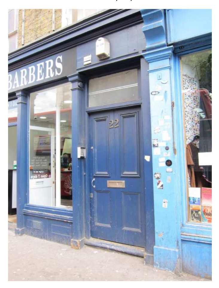
22 Camden Road – existing entrance door and frame