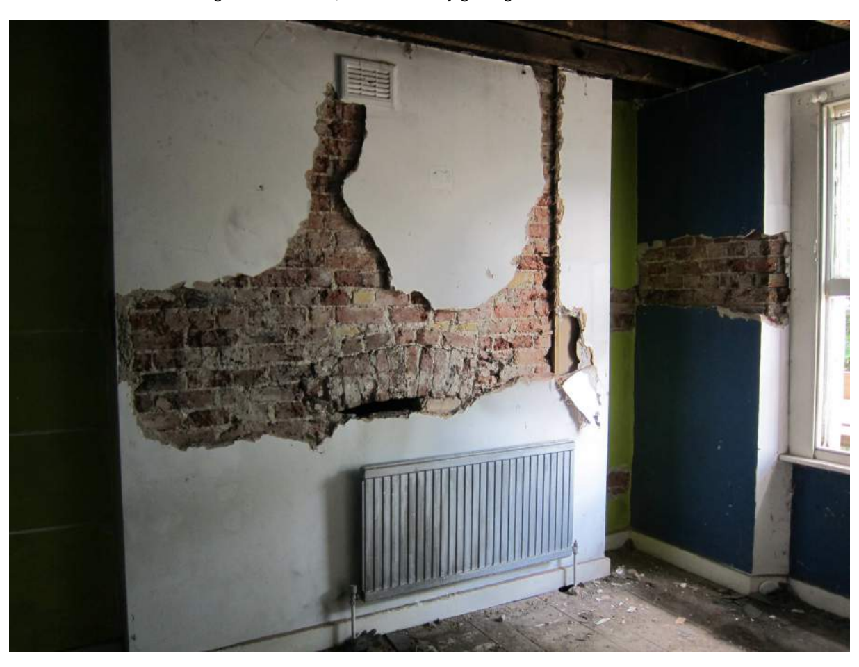
Second floor, back bedroom