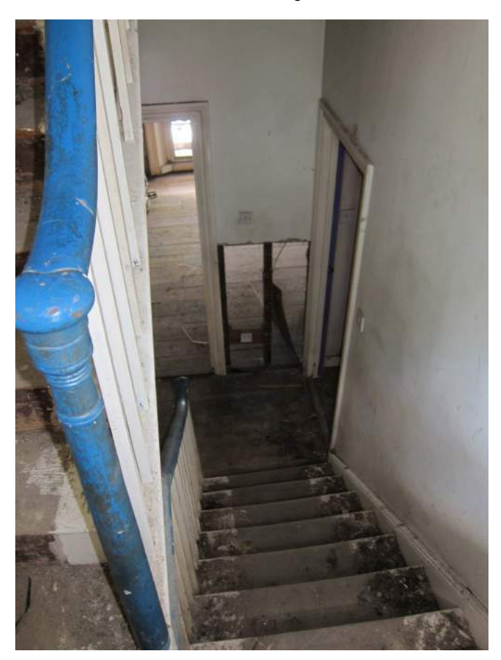
Stairs – view from stir landing towards first floor living room, with door to kitchen on right