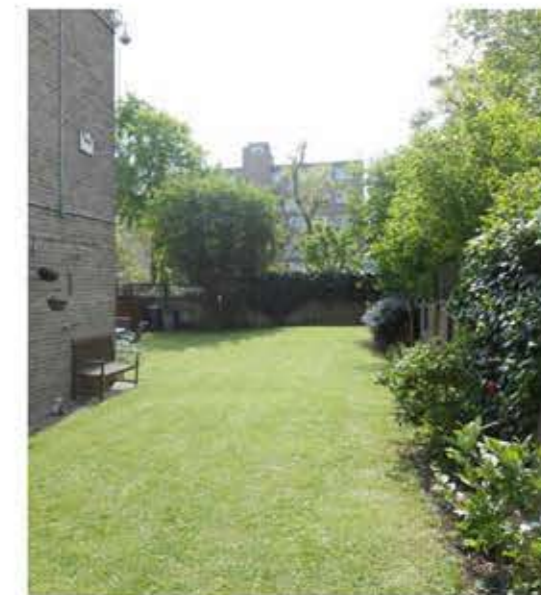
Relation to rear garden view from side elevation towards it NTS