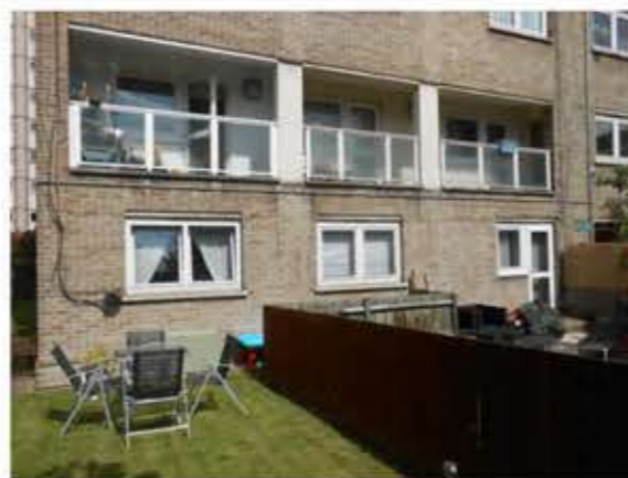
Rear Elevation Photographs NTS