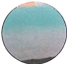
CROSS SECTION OF THE GLASS FIBRE MEDIA USED IN TYPE 90 PANEL FILTERS