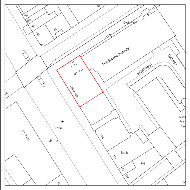
SITE PLAN @ 1:1250 @ A3