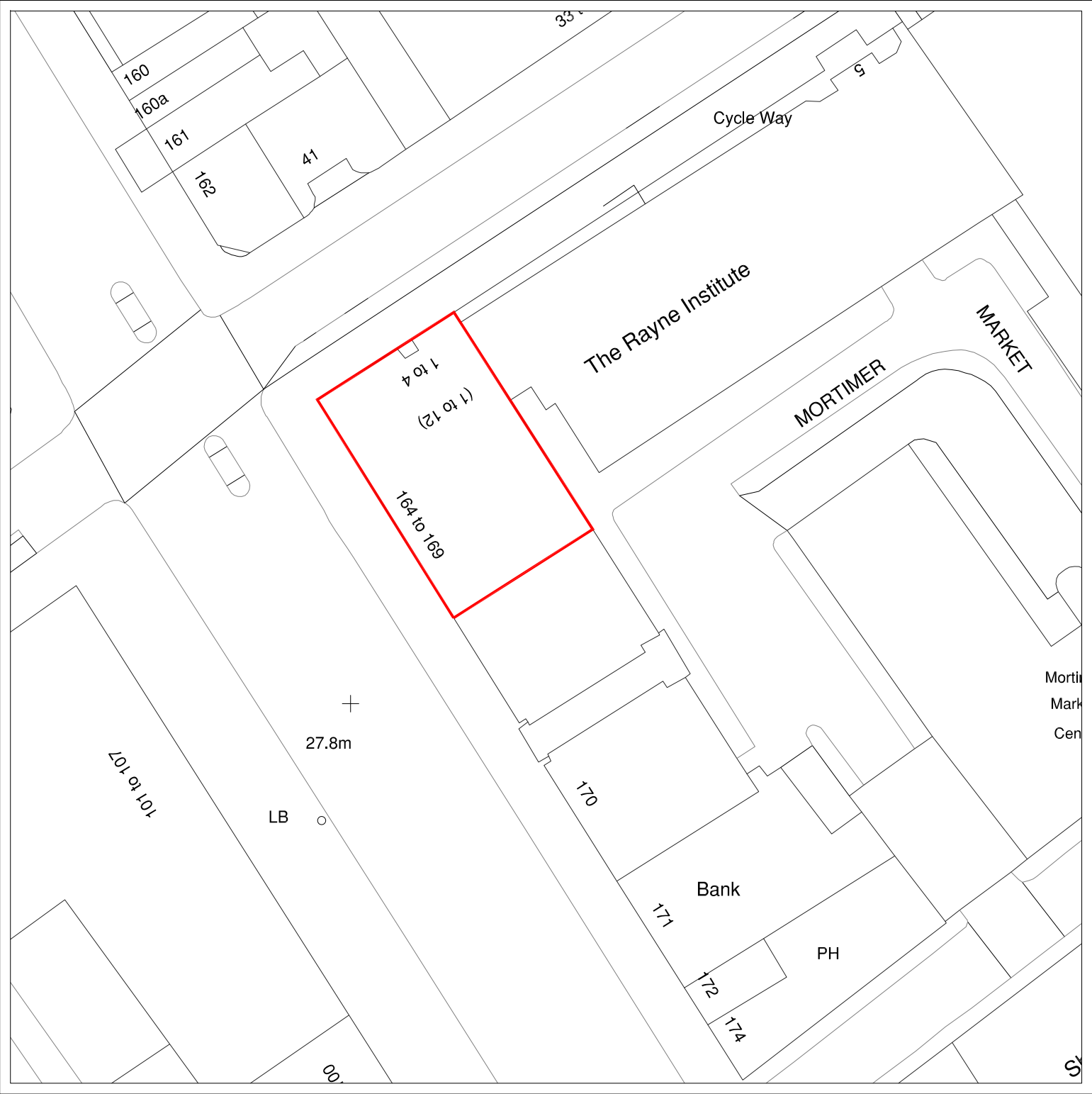
Block Plan Scale bar @ 1:250 @ A1 1:500 @ A3