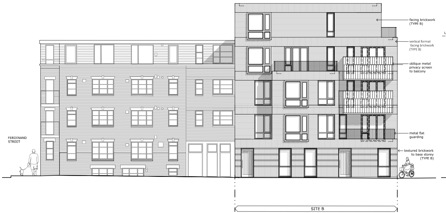
ELEVATION S5 - South (Ferdinand Place)