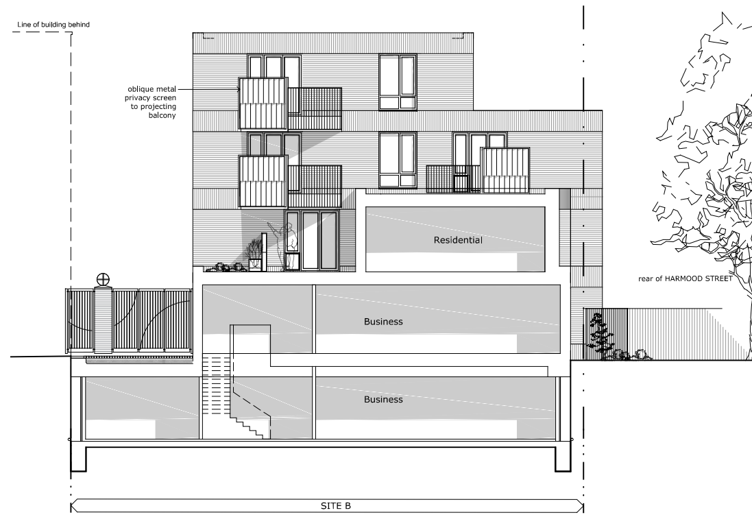
SECTIONAL ELEVATION S5 - looking north