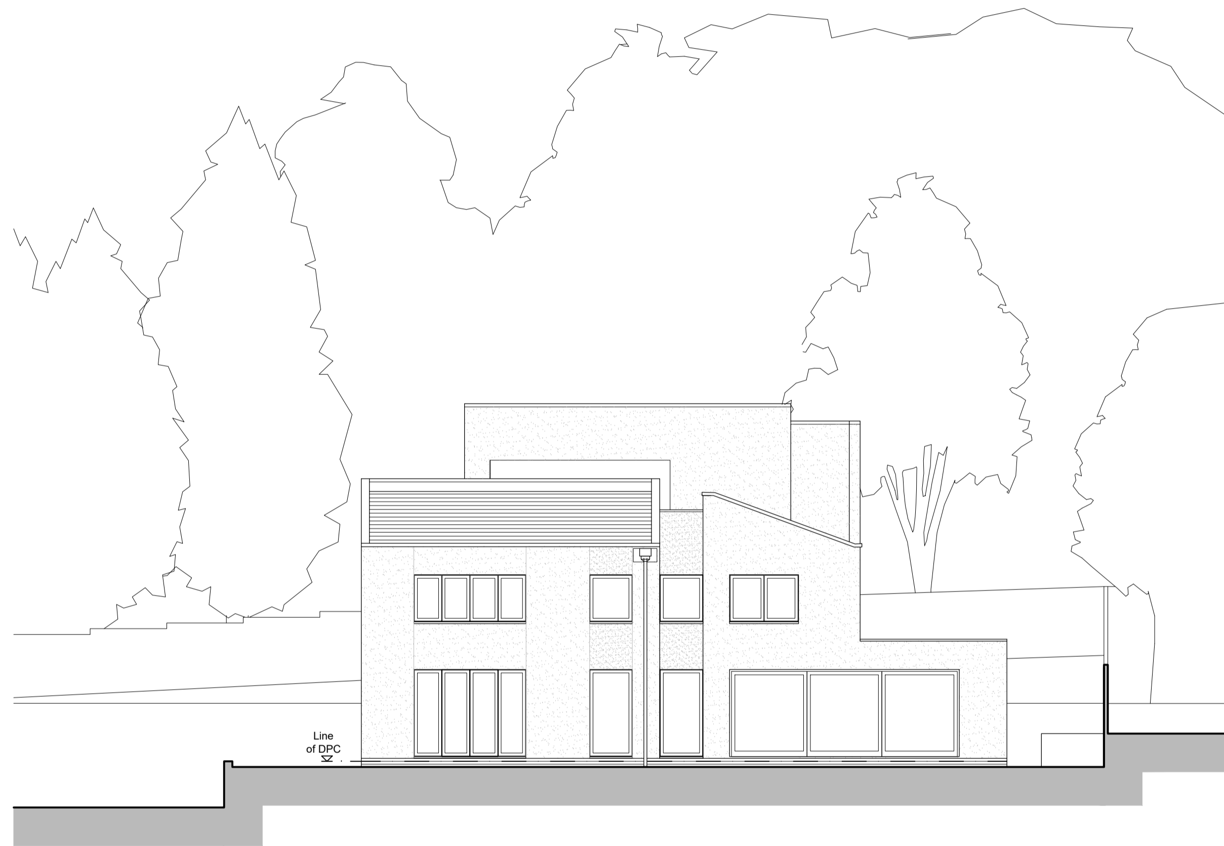
West Elevation (Side)