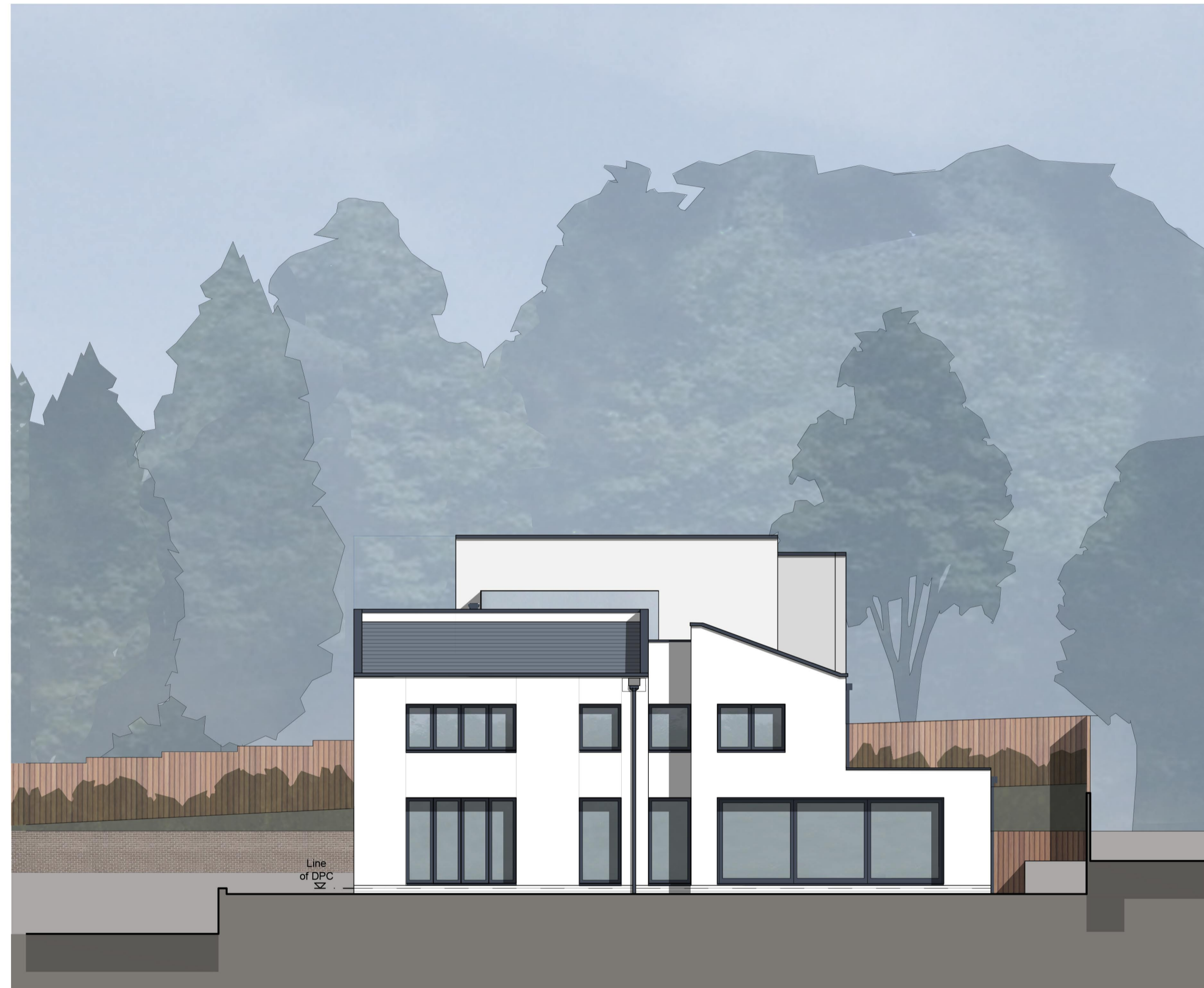
West Elevation (No Change)