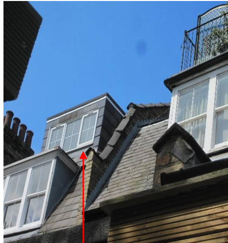
Example 1 of neighbour's dormer window