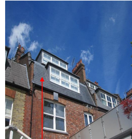
Example 3 of neighbour's dormer window