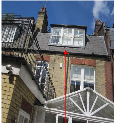
Rear view of 25 Howitt Road