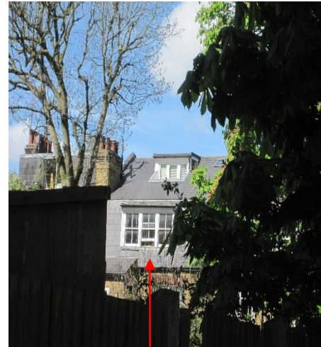
Example 2 of neighbour's dormer window