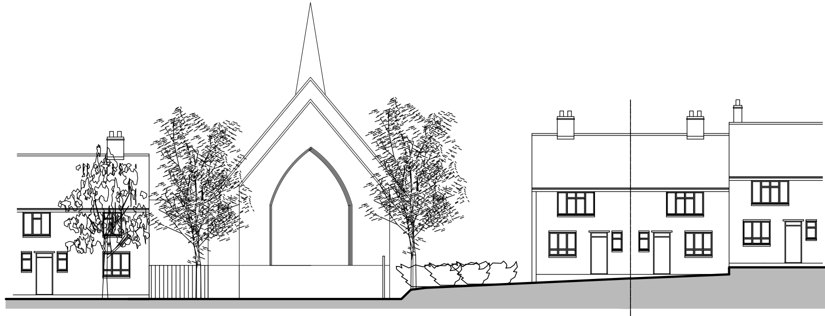
[01] Existing Street Elevation 1:200