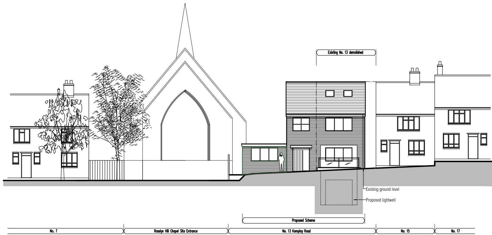
[02] Proposed Street Elevation 1:200