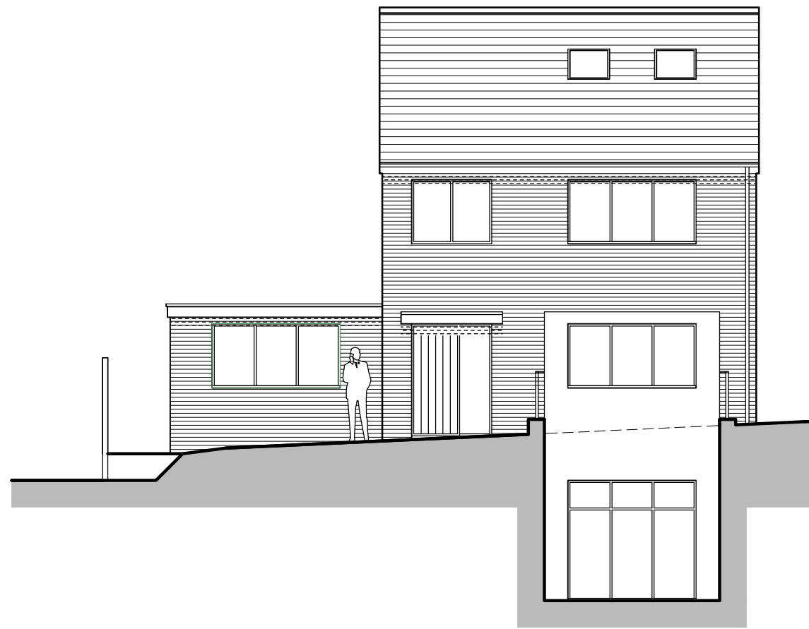
[01] Proposed Front Elevation 1:100