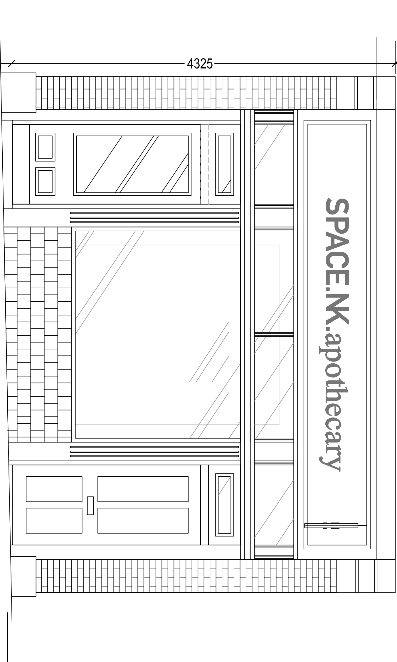
Shopfront Elevation As Existing | Scale 1:25 @ A1