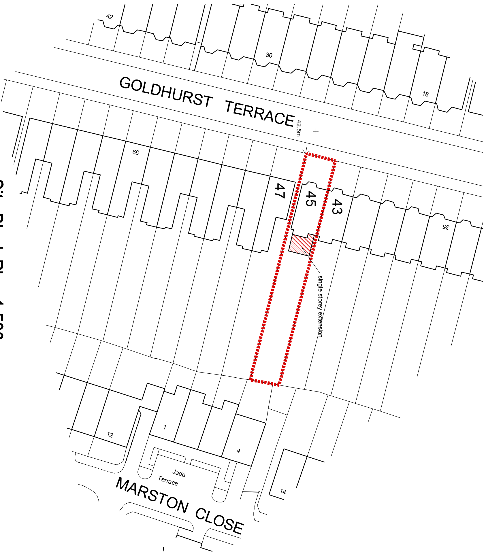
Site Block Plan 1:500