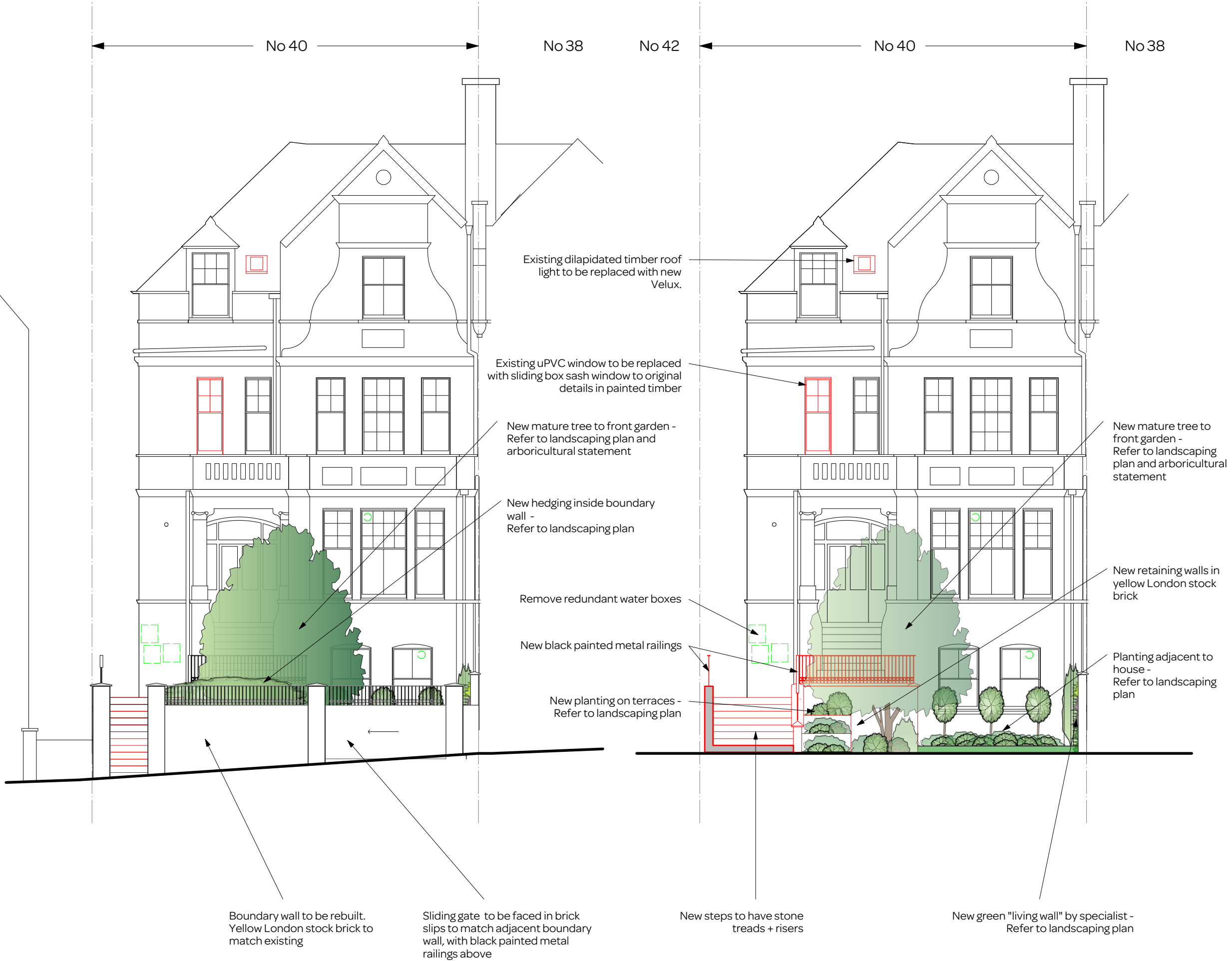
PROPOSED STREET SCENE